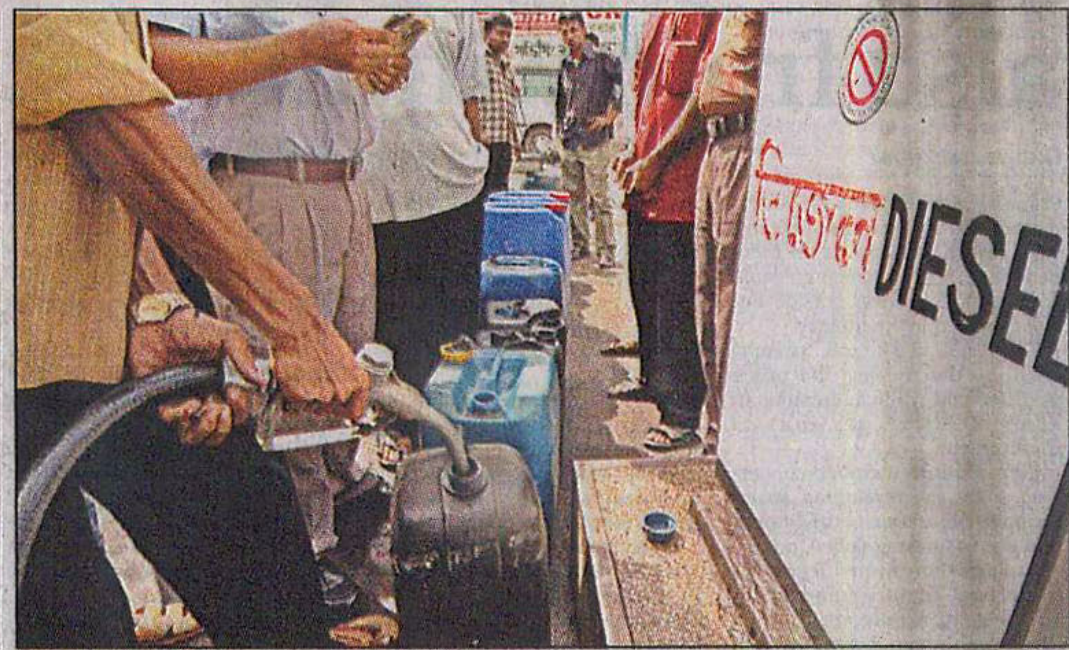
As the city experiences persisting power outages, people queue up at a filling station at Mohakhali in the capital to buy diesel to operate generators.