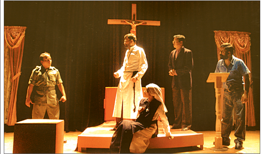
A scene from the play

Nandikar staged Paappunya at the Experimental Theatre Stage on September 15 as part of the programme of staging theatre performances of the troupes from outside Dhaka.