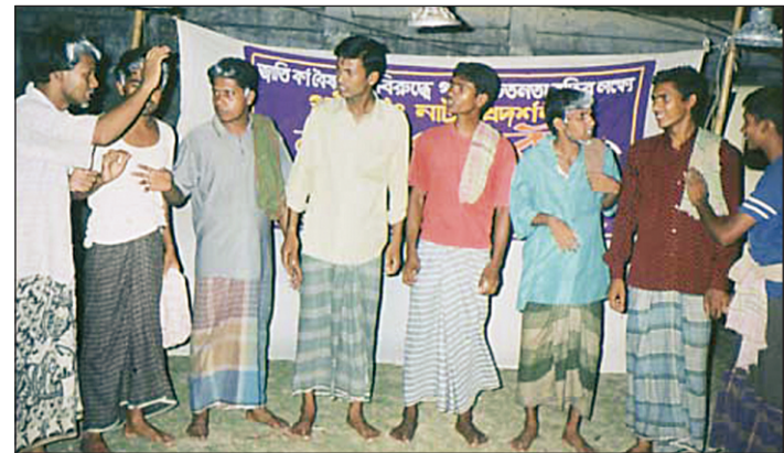
Local artistes perform in the play Palki

The play depicted how marginalised people are deprived of basic rights and addressed how to resolve the issue.