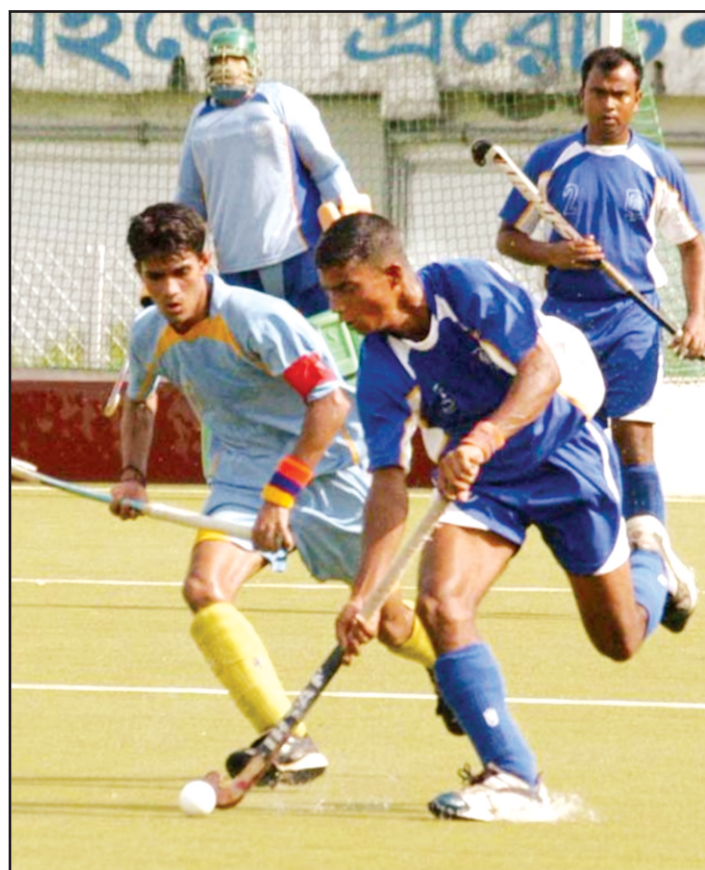
Action from yesterday's Green Delta Insurance First Division Hockey league clash between Uttara Sporting Club and Police AC at the Maulana Bhasani National Stadium.

A total of 16 schools split into four groups will participate in the competition.