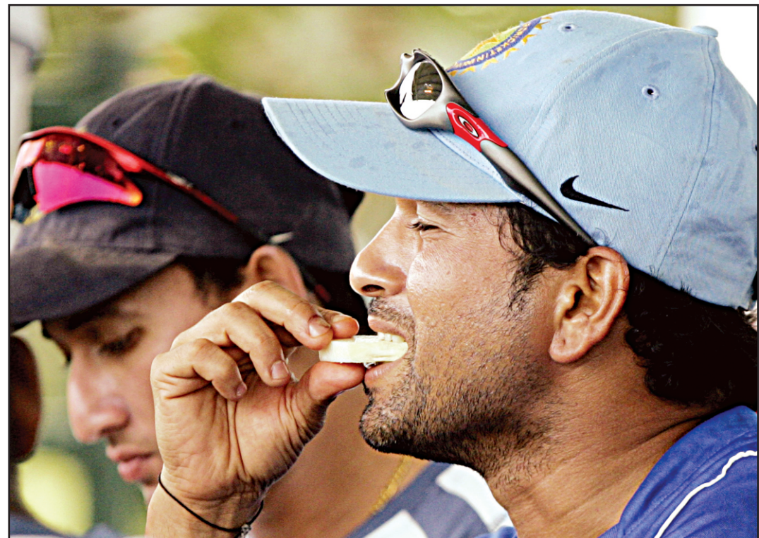
WELL-DERIVED: Indian legend Sachin Tendulkar (R) enjoys a piece of fruit after a practice session in Kuala Lumpur on Friday.