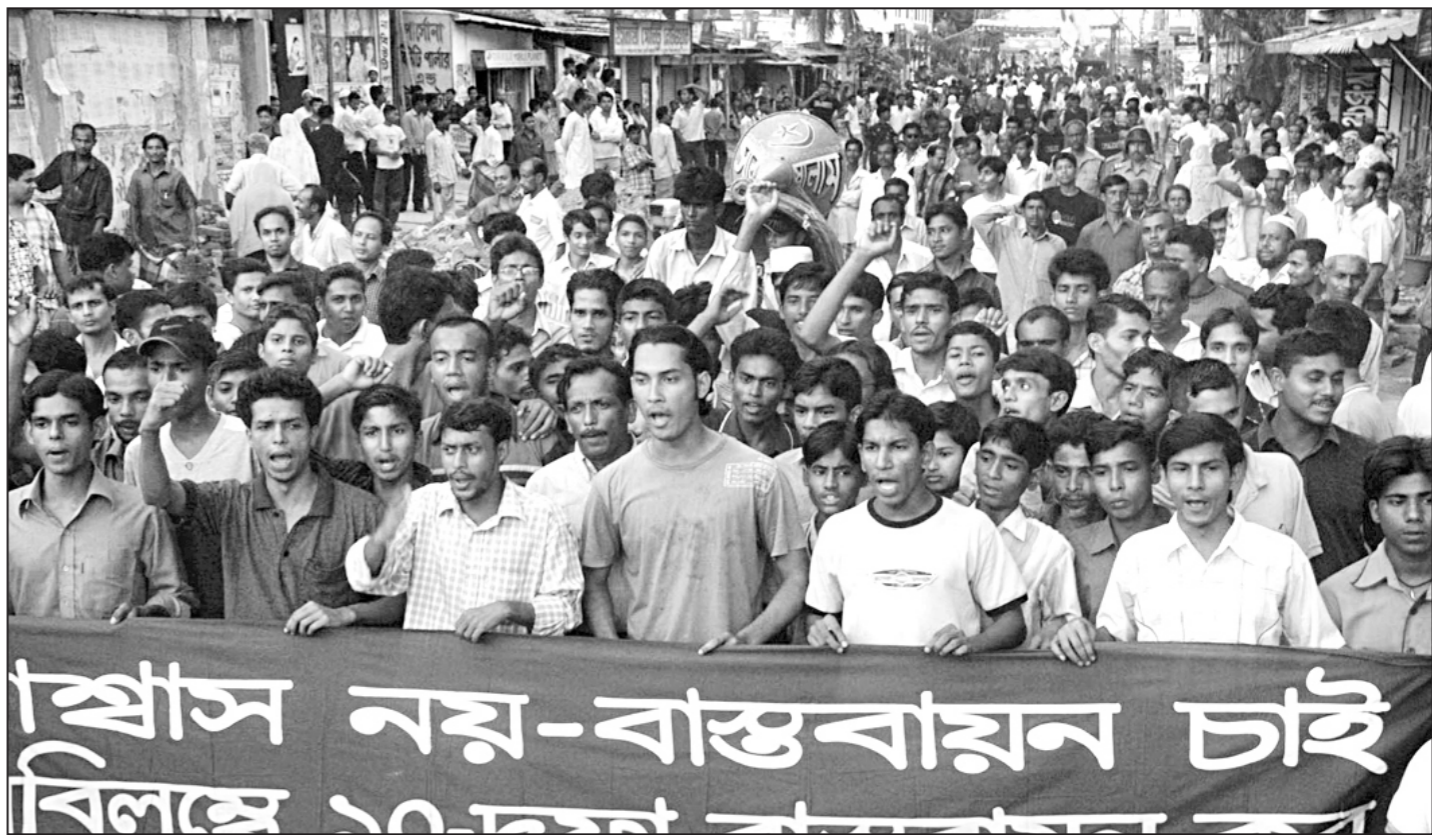
Demra-Shyampur Water-Electricity Action Committee stages a demonstration at Dhania in the city yesterday to press its 10-point demand, including immediate steps to resolve water and electricity crises.

Meanwhile, BCL yesterday expelled its three leaders Mizan, Sohel and Poniruzzaman Ponir.