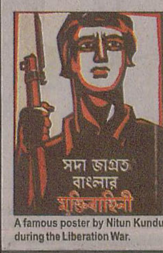
A famous poster by Nitun Kundu during the Liberation War.

STAFF CORRESPONDENT The government yesterday announced that deceased sculptor and freedom fighter Nitun Kundu will be given state honour at his funeral at the Central Shaheed Minar today at 11:00am. The body of Nitun Kundu will be first taken to the Institute of Fine Arts on the Dhaka University campus at 10:00am today.