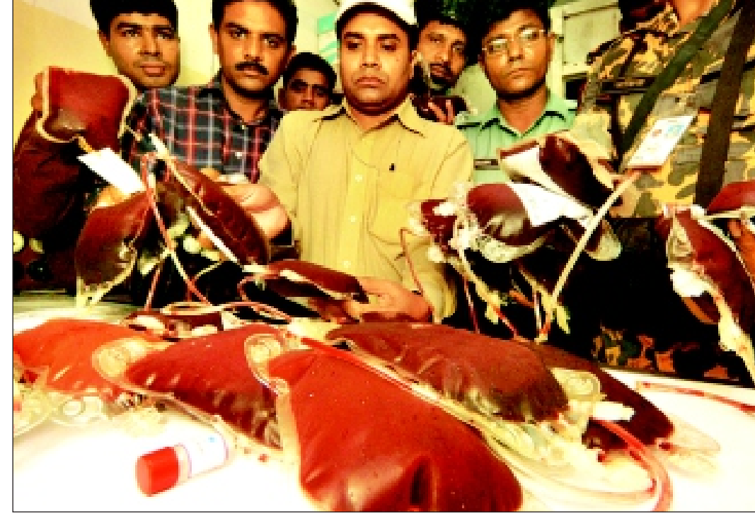
A mobile court seizes blood bags from an unauthorised blood bank at Aziz Super Market in Shahbagh in the capital

In the first recovery, the mobile court raided Royal Blood Bank at 53 SEE PAGE 15 COL 7