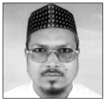
Kazi Nazrul Islam of Jamaat