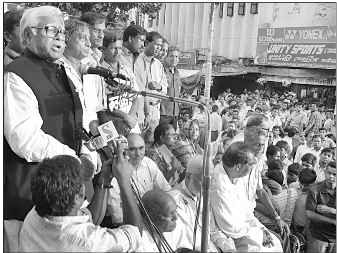
Awami League General Secretary Abdul Jalil speaks at a rally at Bangabandhu Avenue in the city yesterday. 14-party opposition combine staged the demonstration in protest against the police atrocities on its leaders and workers during the PMO siege programme on Tuesday.

Tofail said if the government hands over power to the caretaker government without implementing reform proposals, the opposition will paralyse the country through non-stop hartal.