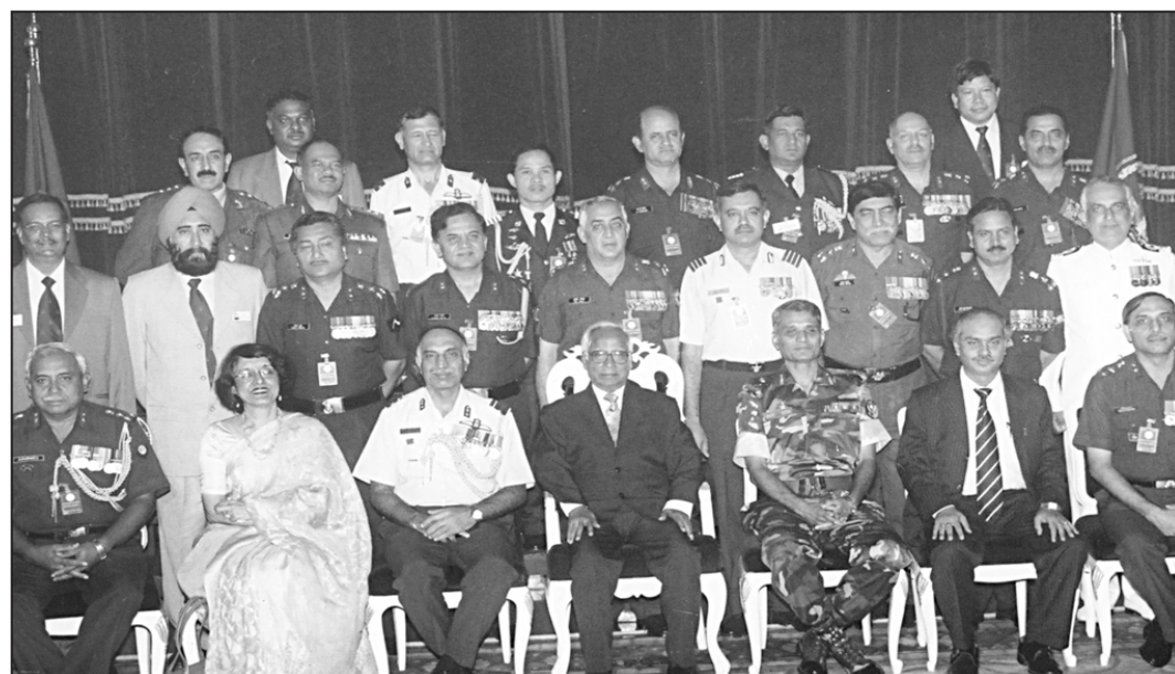
Members of a delegation of National Defence College of India pose for photograph with President Iajuddin Ahmed at Bangabhaban in the city yesterday.

So, the restriction on the entry of visitors was imposed this time, he added.