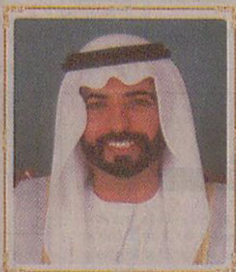
H. E. Sheikh Nahayan Mubarak Al Nahayan Founder Chairman, Bank Alfalah Limited

THE ABU DHABI GROUP is an establishment owned by His Highness Sheikh Nahayan Mubarak Al Nahayan. The Group is responsible for the overall supervision and reporting of the performance of all investments and across all markets under its fold.