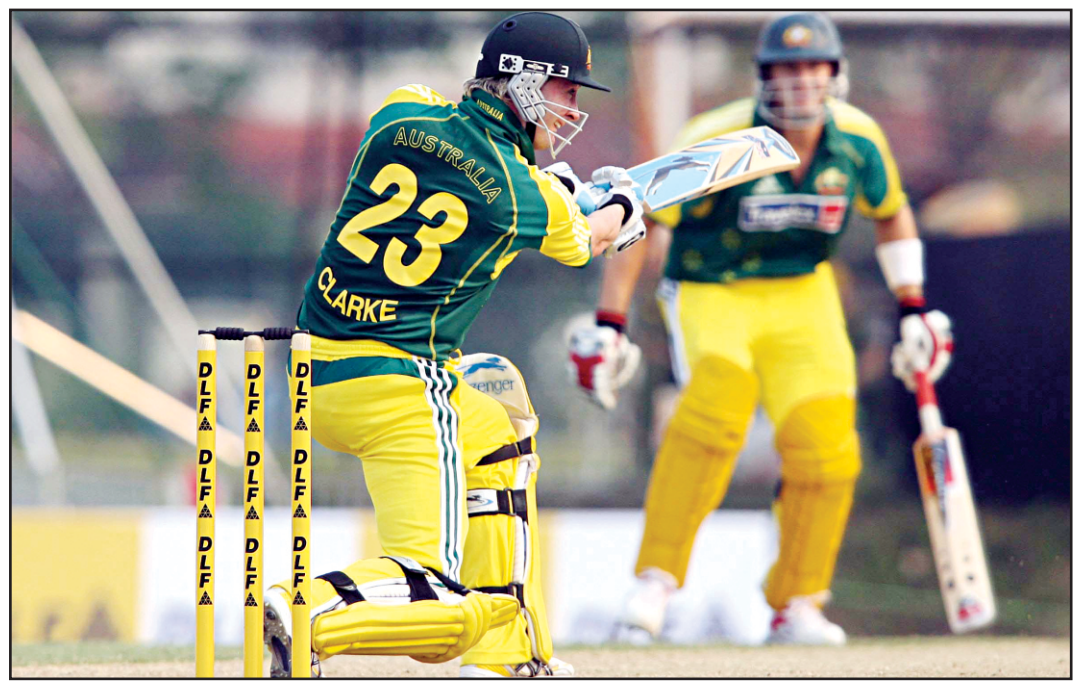
Australia batsman Michael Clarke drives the ball on the off-side during the opening match of the DLF Cup against West Indies at the Kinrara Oval in Kuala Lumpur on Tuesday.

Flintoff, 28, and Strauss were vying for the captaincy in the absence of last year's Ashes-winning skipper Michael Vaughan,