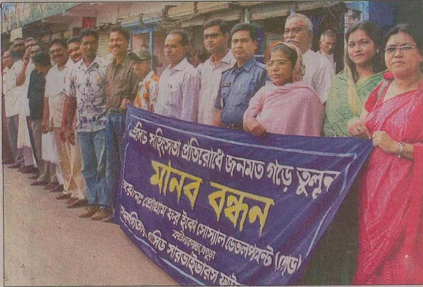
Programme for Eco Social Development (PESD) forms a human chain at Gabtali in Bogra yesterday to raise mass awareness about acid violence.