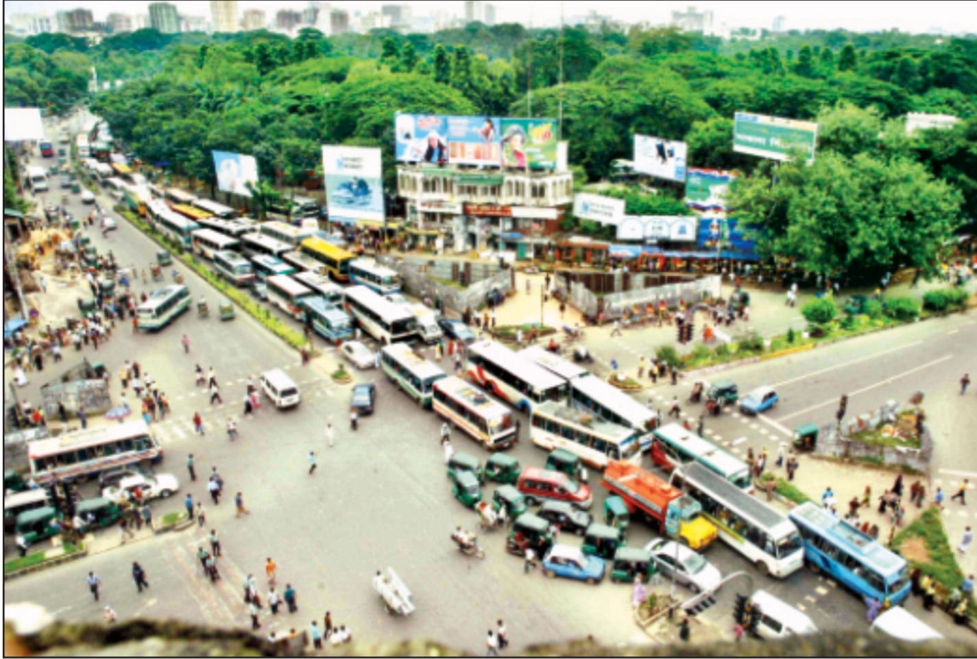
Vehicles get stuck in a gridlock as the police barricaded a number of roads in the city during the AL-led 14-party opposition combine's PMO siege programme yesterday. The picture was taken from Shahbagh intersection.