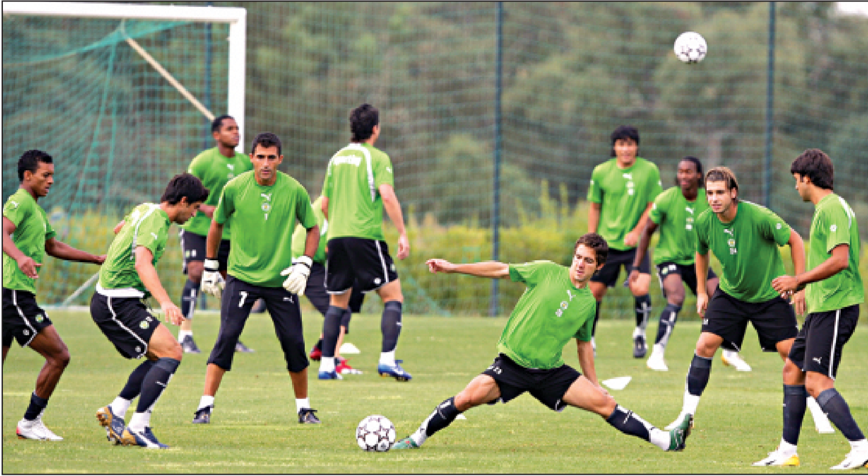
Sporting Lisbon footballers train for their Champions League clash against Inter Milan at the Sporting Academia in Alcochete on Saturday.