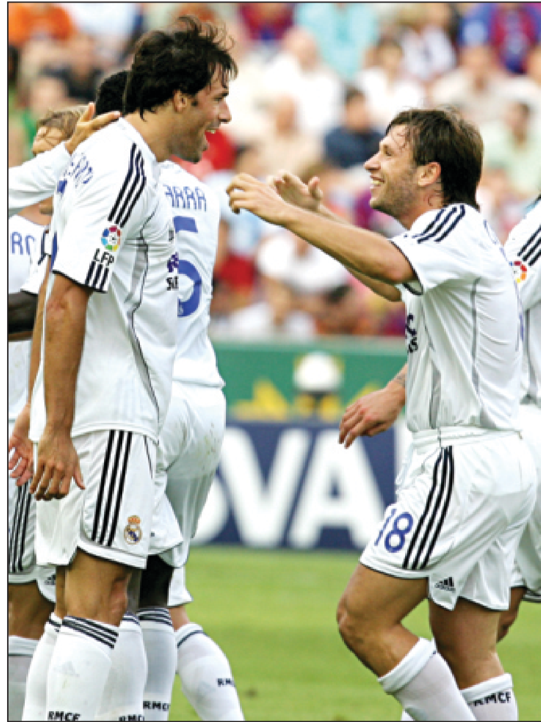
Real Madrid striker Ruud van Nistelrooy (L) celebrates his goal against Primera Liga rivals Levante with teammate Antonio Cassano at Ciudad de Valencia Stadium on Sunday.

Getafe also retained their unbeaten record with a 1-0 win over Racing Santander, with Daniel Guiza getting the only goal of a scrappy game just before the hour to put the Madrid side up to third.