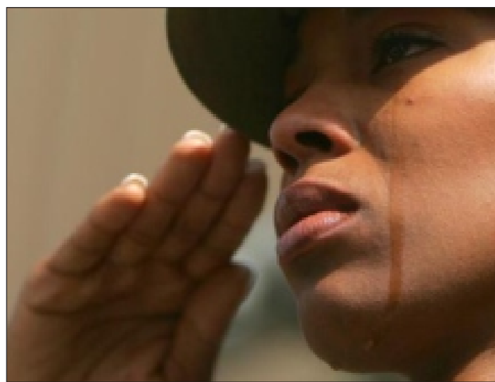
A tearful US sergeant at a somber ceremony in Kabul, Afghanistan yesterday to mark the fifth anniversary of September 11, 2001 attacks on US.

A moment of silence was... SEE PAGE 15 COL 7