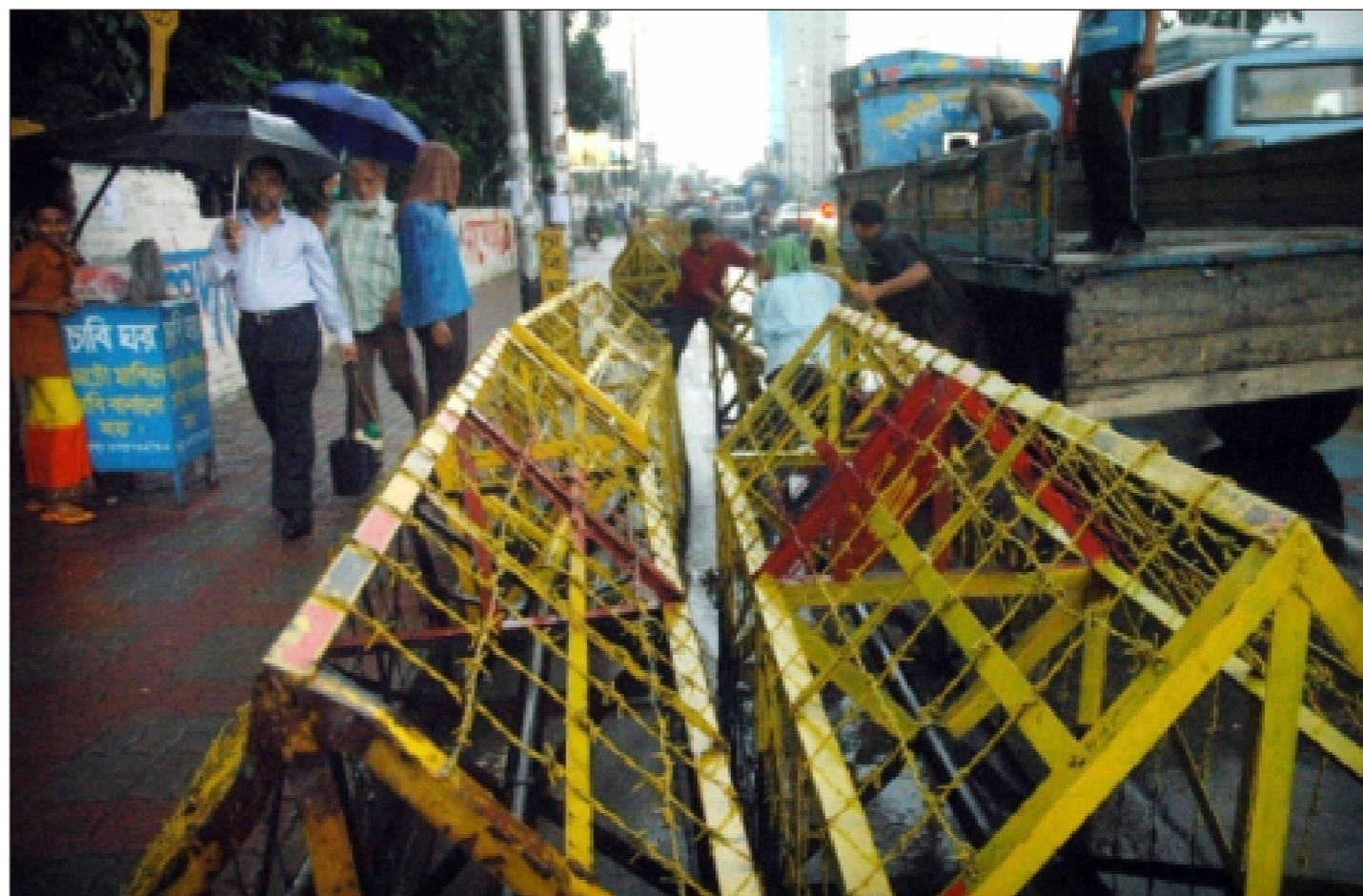
Barbed wire barricades kept on Tongi Diversion Road for using to stop the opposition's Prime Minister's Office siege programme today.

The bomber struck after funeral... SEE PAGE 15 COL 8