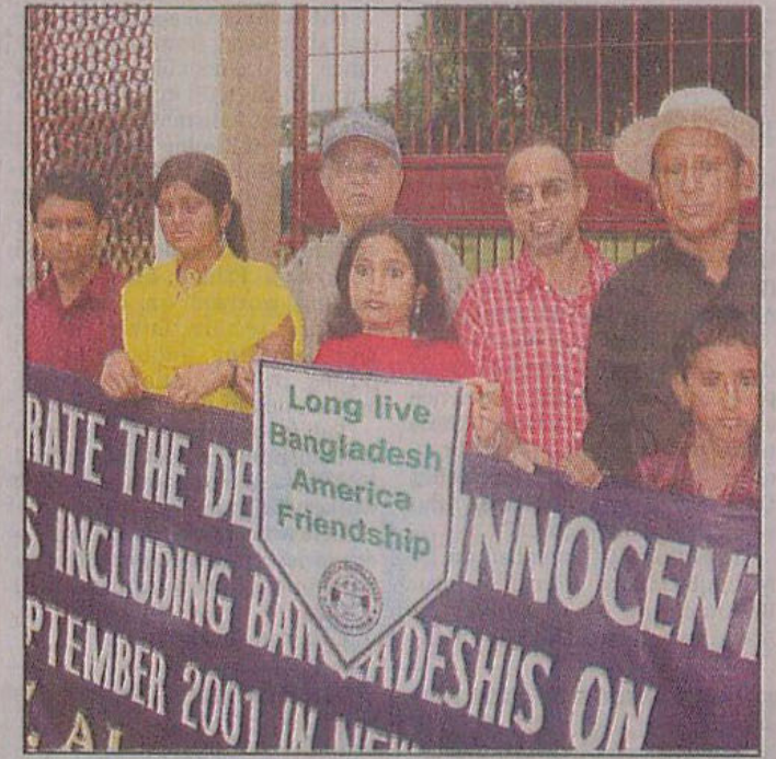
America-Bangladesh Friendship Forum forms a human chain in front of the High Court in the city yesterday to commemorate the victims who died in 9/11 terrorist attack in the United States in 2001.