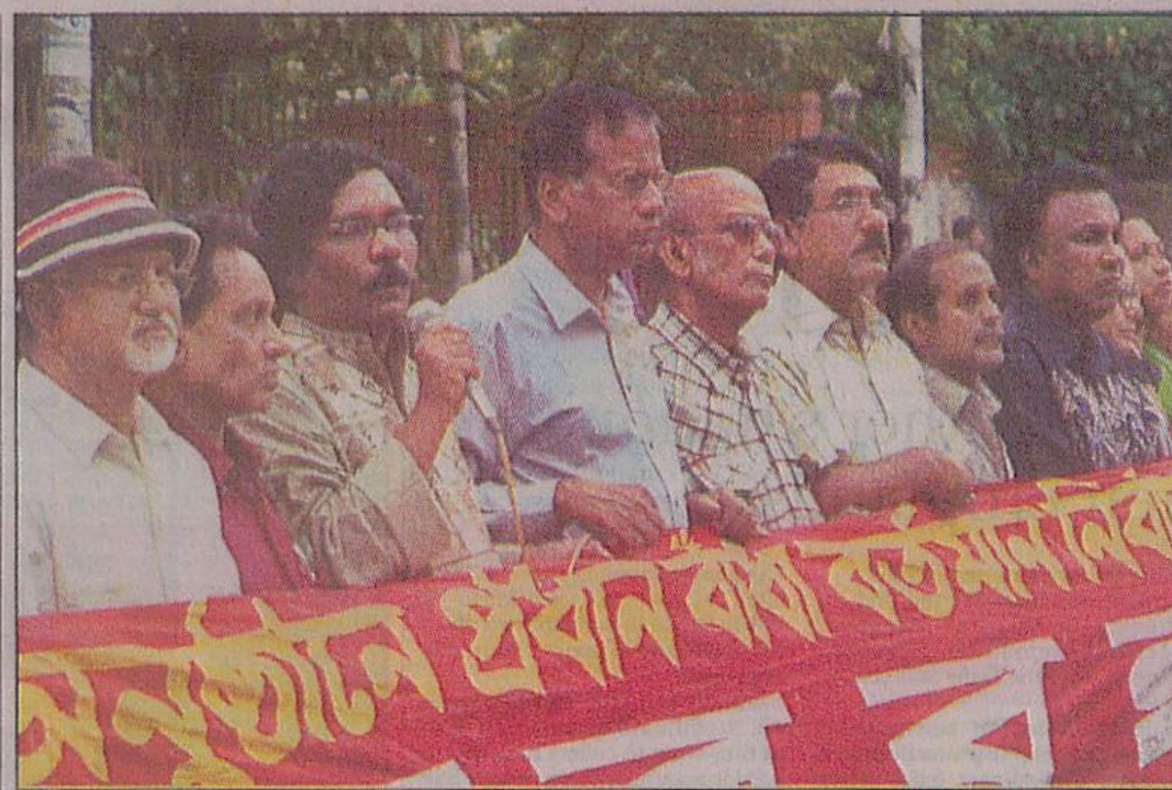
Sammilita Sangskritik Jote forms a human chain at Shahbag in the city yesterday demanding resignation of the Chief Election Commissioner to ensure free and fair elections.

Police said there were many marks of injury on the bodies. They sent them to Cox's Bazar General Hospital for autopsy and filed an unnatural death case with Ukha Police Station.