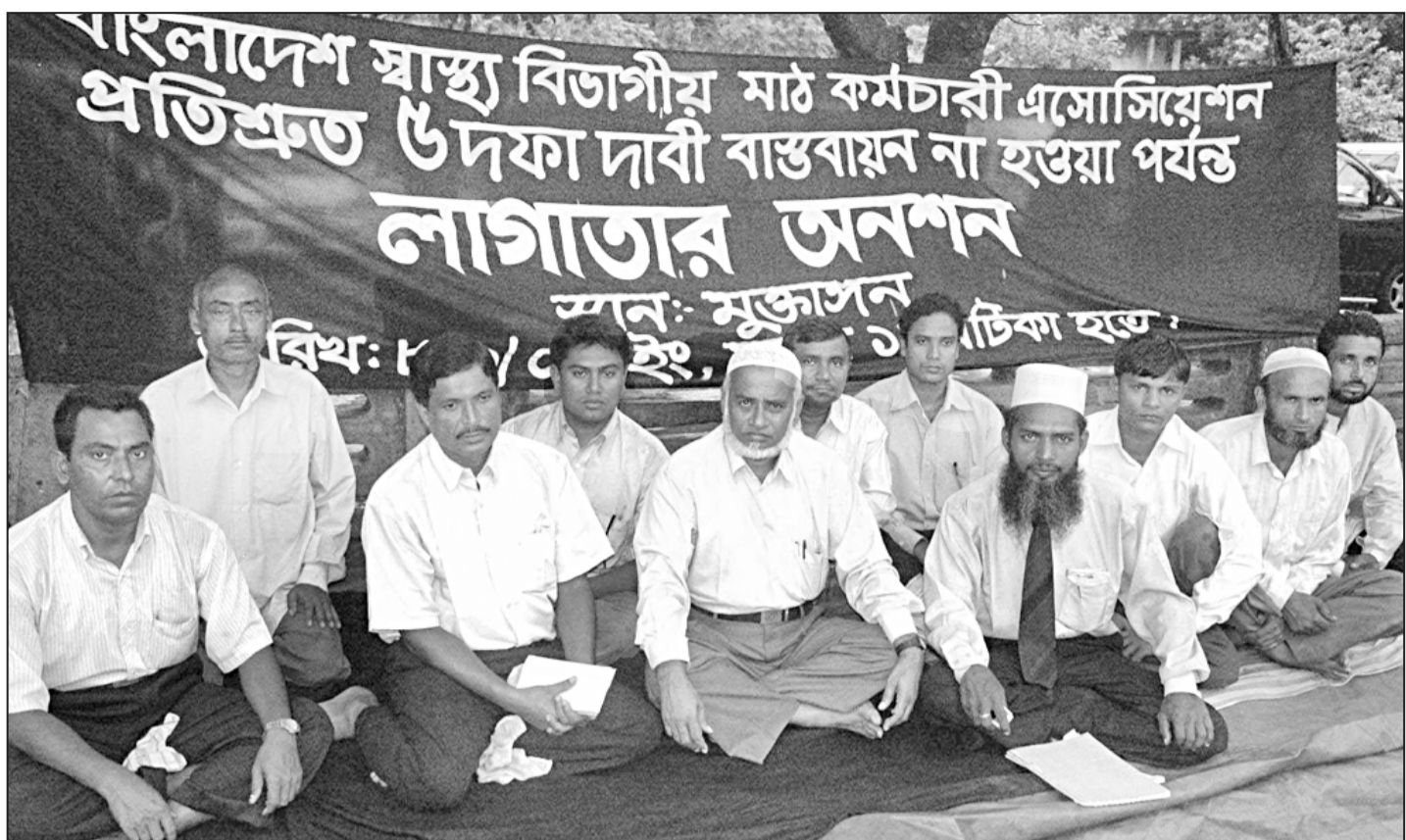
Health Department employees continue their hunger strike at Muktangan in the city yesterday to press their five-point demand.

The six stations are Dhaka, Tejgaon, Dhaka Cantonment, Biman Bandar, Tongi and Dirasram.