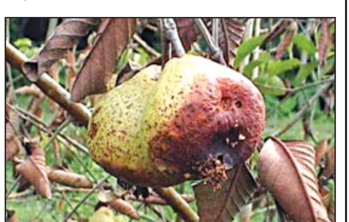
A rotten guava on an affected plant in an orchard in Magura Sadar upazila.