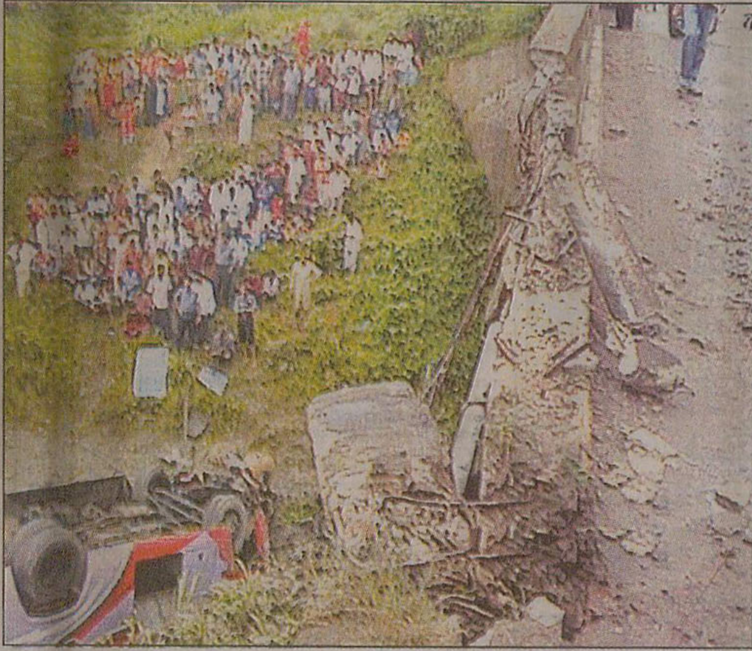
A passenger bus and a taxicab lie crashed after they fell off the Pakulla Bridge over Satiachara Goran canal on Dhaka-Tangail highway in Tangail after a head-on collision yesterday.