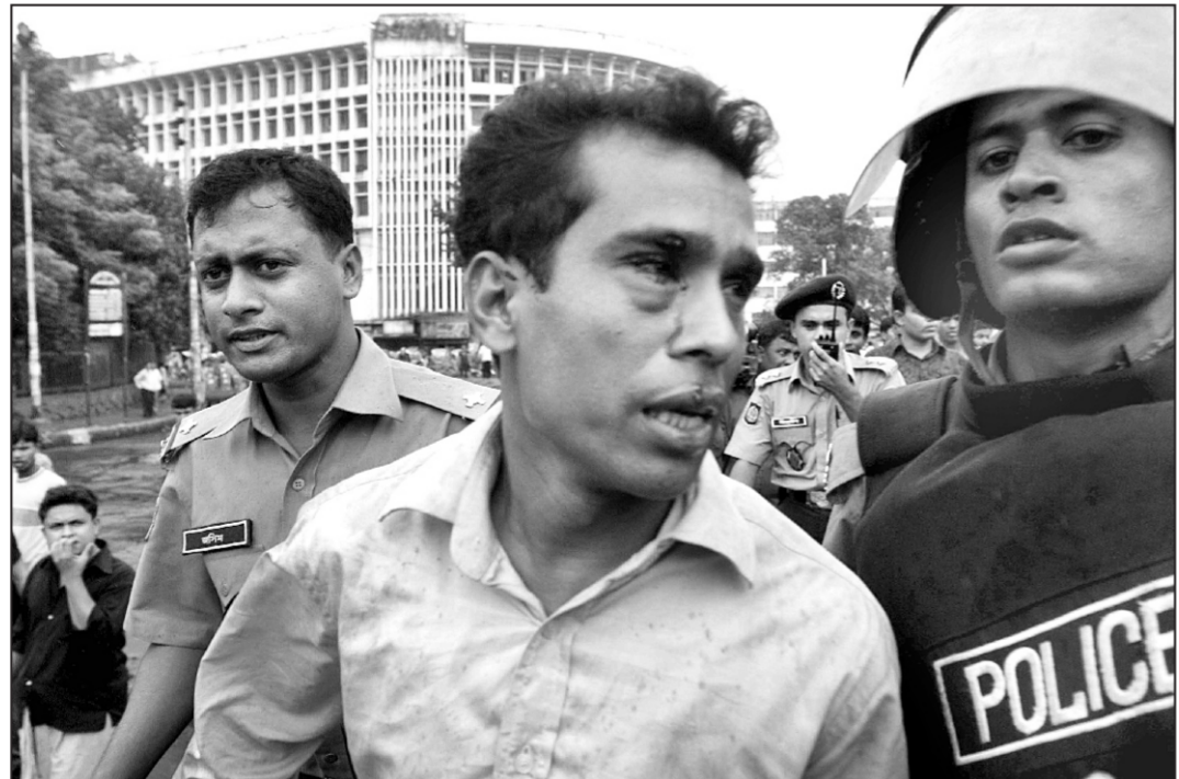
Police intercept the women activists of the opposition Awami League at Paltan intersection in the city yesterday, top, while a Chhatra League activist is being taken to custody at Shahbagh during hartal hours, bottom.