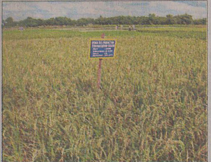
The hybrid paddy that shot up from ratoons is being grown by Rangpur Dinajpur Rural Service (RDRS), a non-government organisation, in Rangpur.