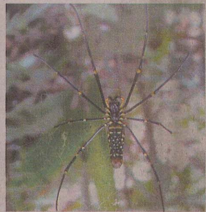
The brilliant spiders you can see everywhere in the forest.

Although the rainy season is rough enough for the visitors and tourists due to heavy rains and some unexpected mos-