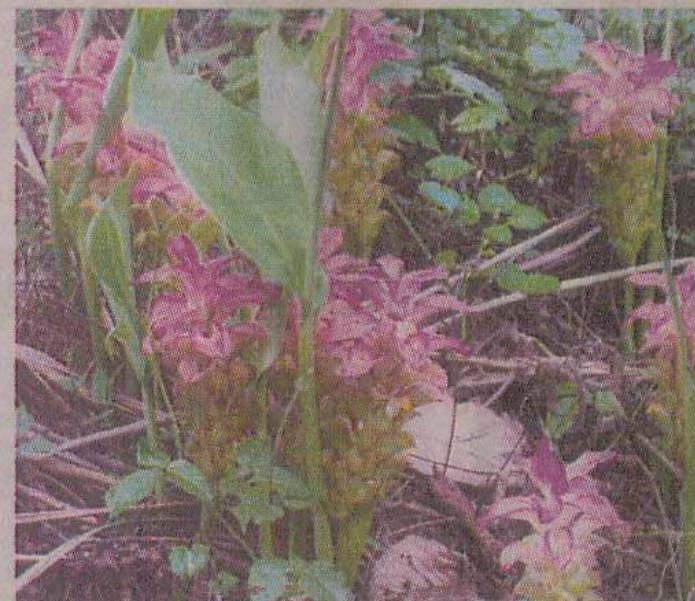
Inflorescence of Curcuna hussainii

building creativity could pave the way to reopen your mindset again! You would probably be amazed and more impressed with these beautiful creations. The forest has long been considered as heaven for entomologist, specially interested in