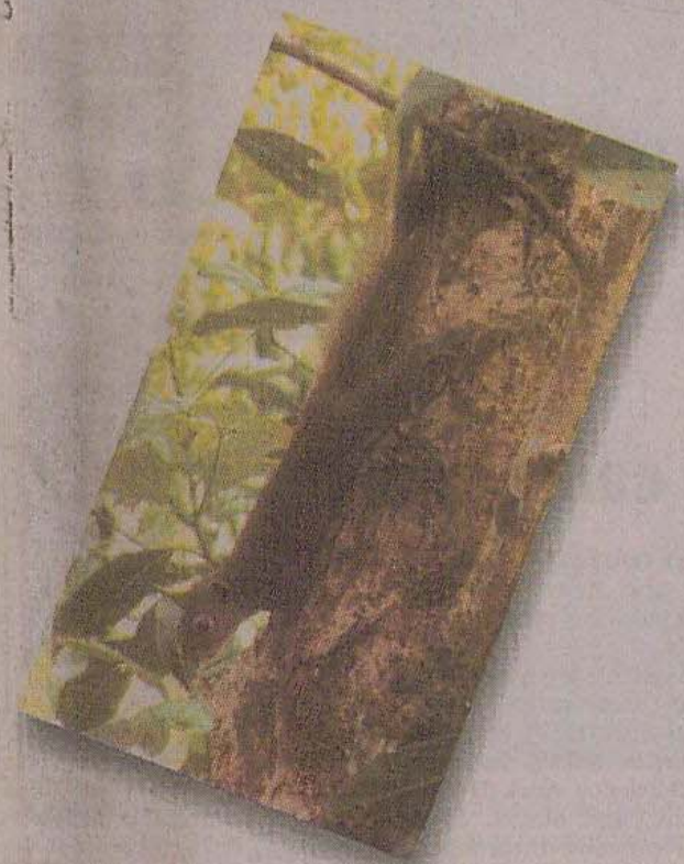
A good climber always on the move.

Many more times the train crosses the park jolting the wildlife fauna.