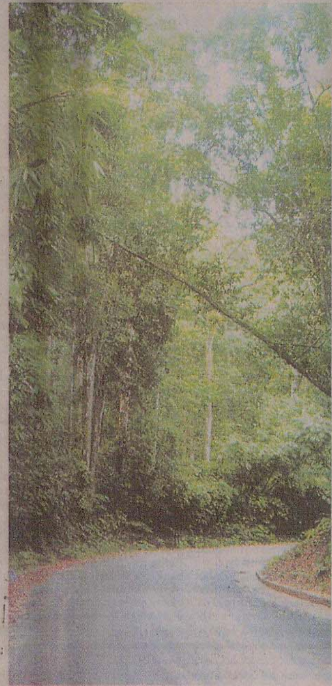
Cris-cross road through the park.