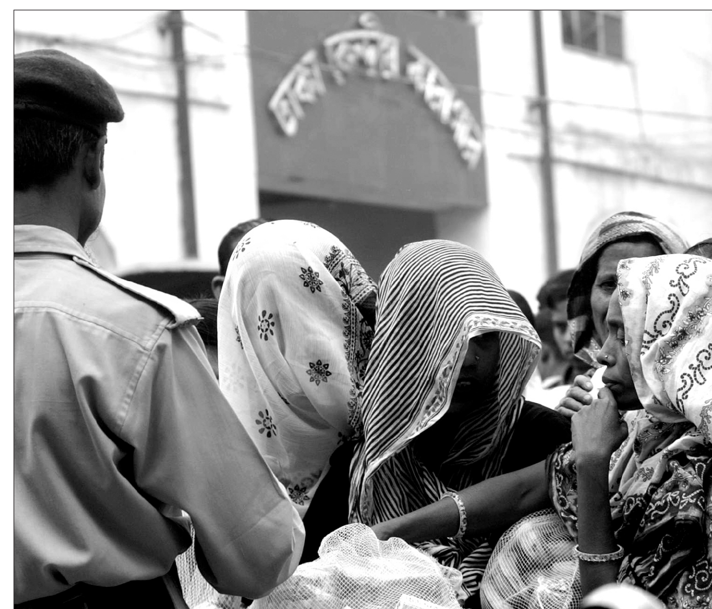
Detainees are transported to the central jail (left) while relatives wait outside the jail gate helplessly to find out their loved ones (right).