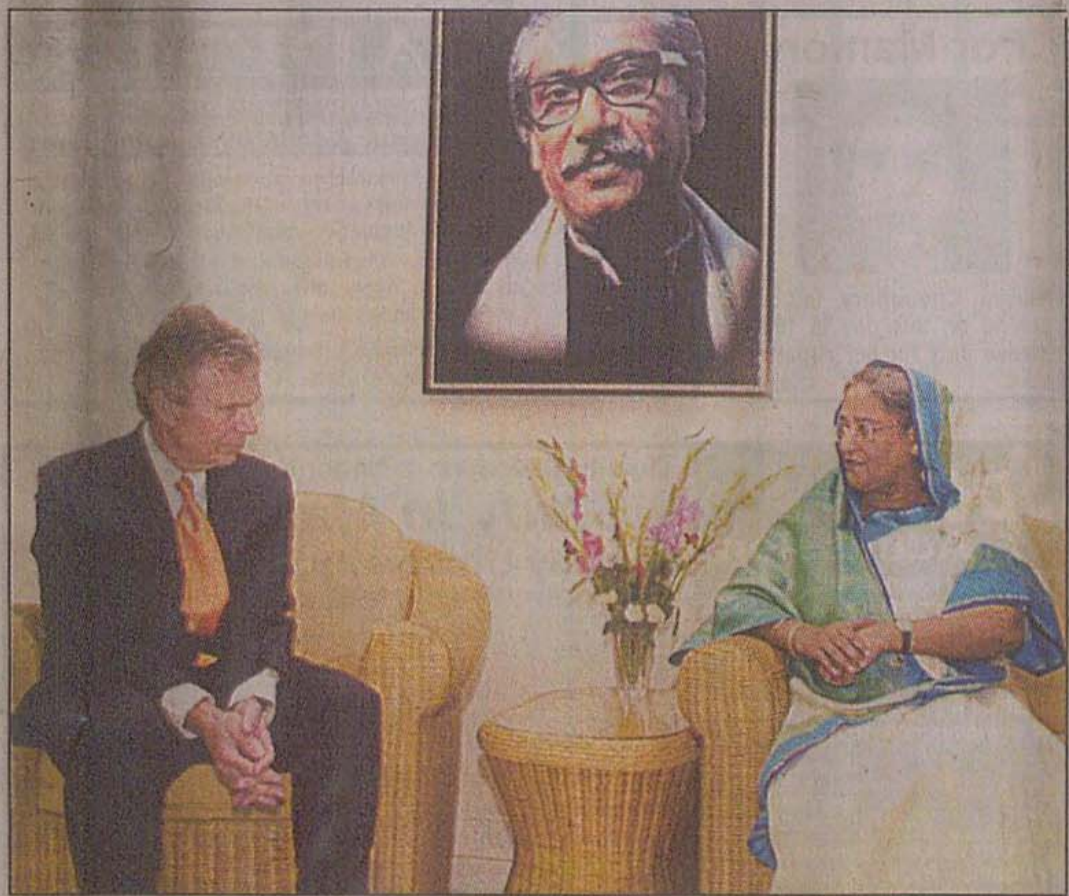
A delegation of Washington-based National Democratic Institute, led by Tom Daschle, calls on Awami League President Sheikh Hasina at the party office at Dhanmondi in the city on Friday.