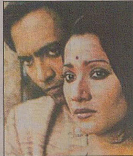
A scene from Brick Lane

During the shooting of the film in Brick Lane, the film making company was forced to reschedule filming after learning that the local community from East London were planning to disrupt filming by staging a protest on particular days.