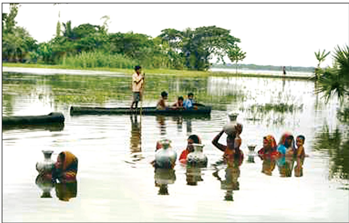
Negotiating neck-deep water, women returning home in Benekhali village in Satkhira Sadar upazila with drinking water procured from a far away place as all tube wells in their village are submerged.