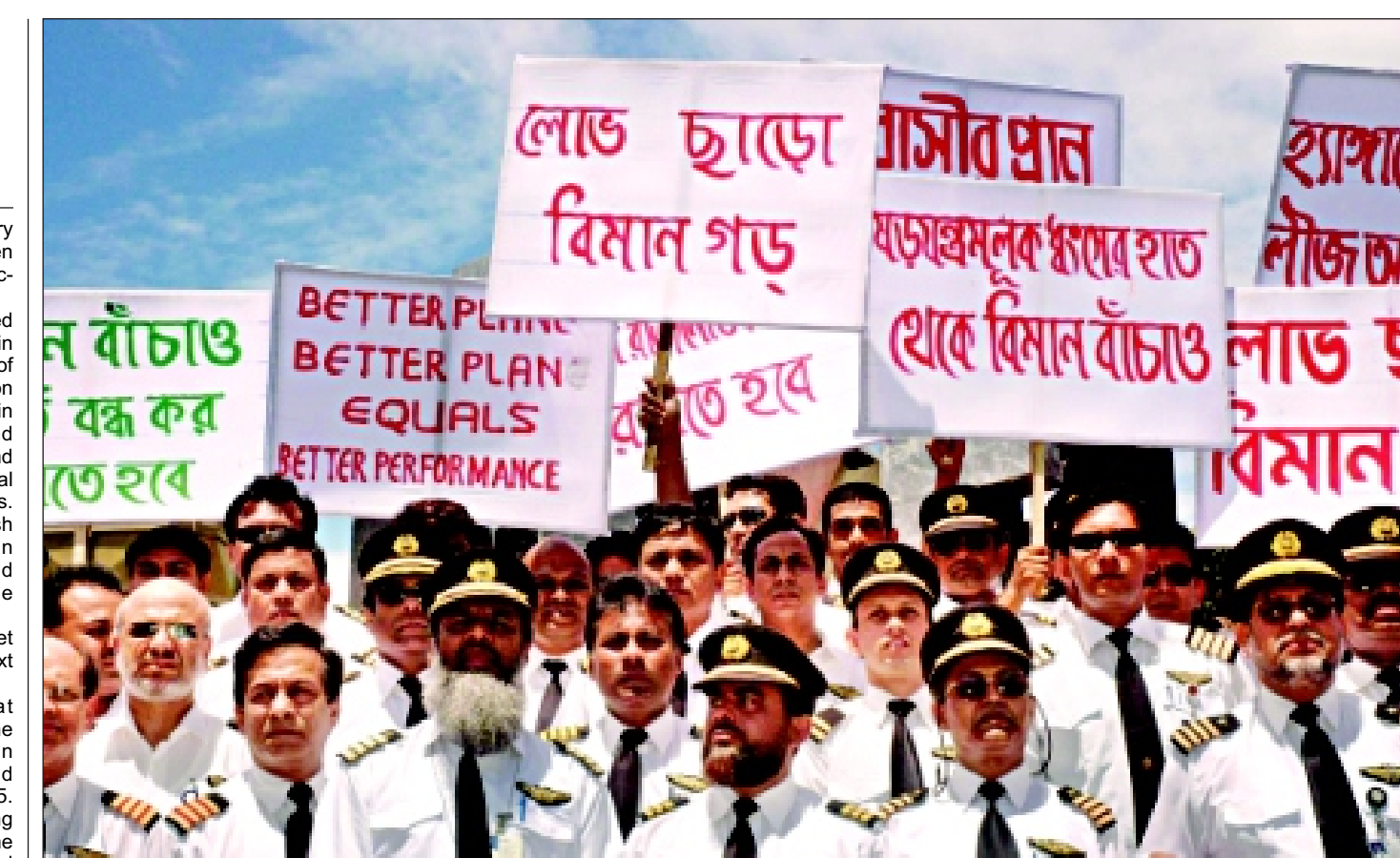
Bangladesh Airline Pilots Association stages a demonstration in front of Biman headquarters yesterday, demanding immediate measures to make the airline