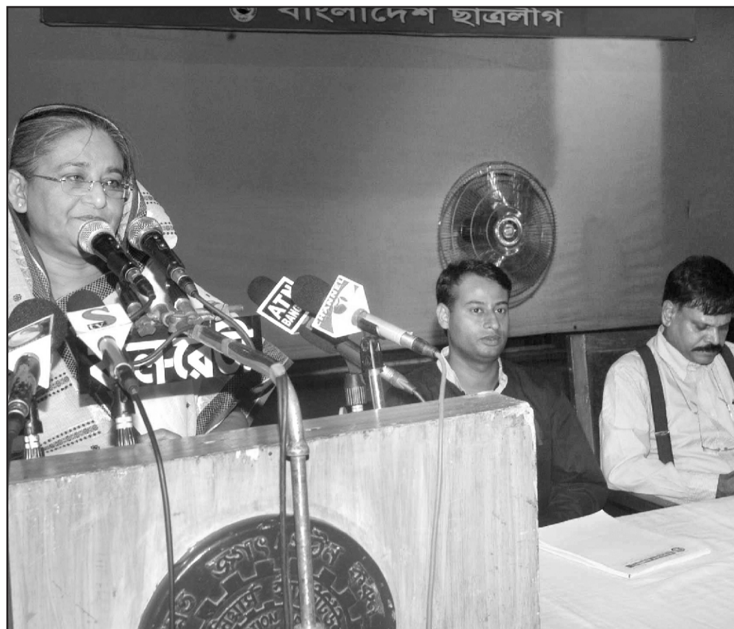
Awami League President Sheikh Hasina speaks at a discussion on 'Bangabandhu Sheikh Mujibur Rahman and Begum Fazilatunnesa' at the Engineers' Institute auditorium in the city yesterday. Bangladesh Chhatra League organised the discussion.

Fifteen were physically abused, acid was thrown on 11 women, 31 women and children were trafficked and 13 met unnatural death.