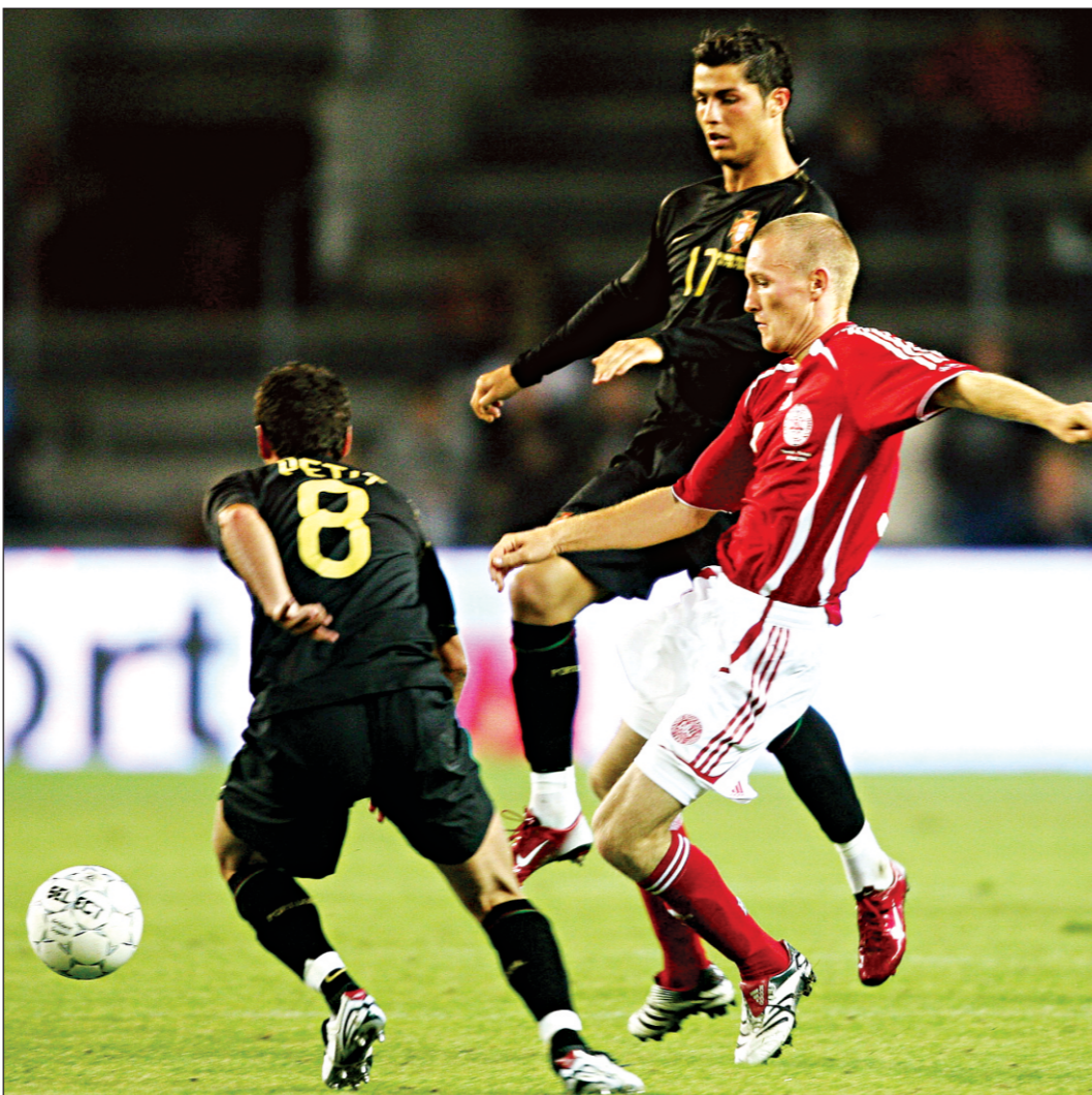
Portugal midfielders Petit (L) and Cristiano Ronaldo (C) crowd out Denmark's Thomas Kahlenberg during their international friendly in Copenhagen on Friday.

Meanwhile, the Premier League have announced the transfer of 18-year-old midfielder Denilson from Sao Paolo to Arsenal, although the club have not confirmed the move.