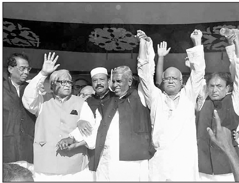
14-party leaders wave to the crowd (left) at Osmani Udyan in Sylhet city prior to starting their Sylhet divisional long march yesterday.