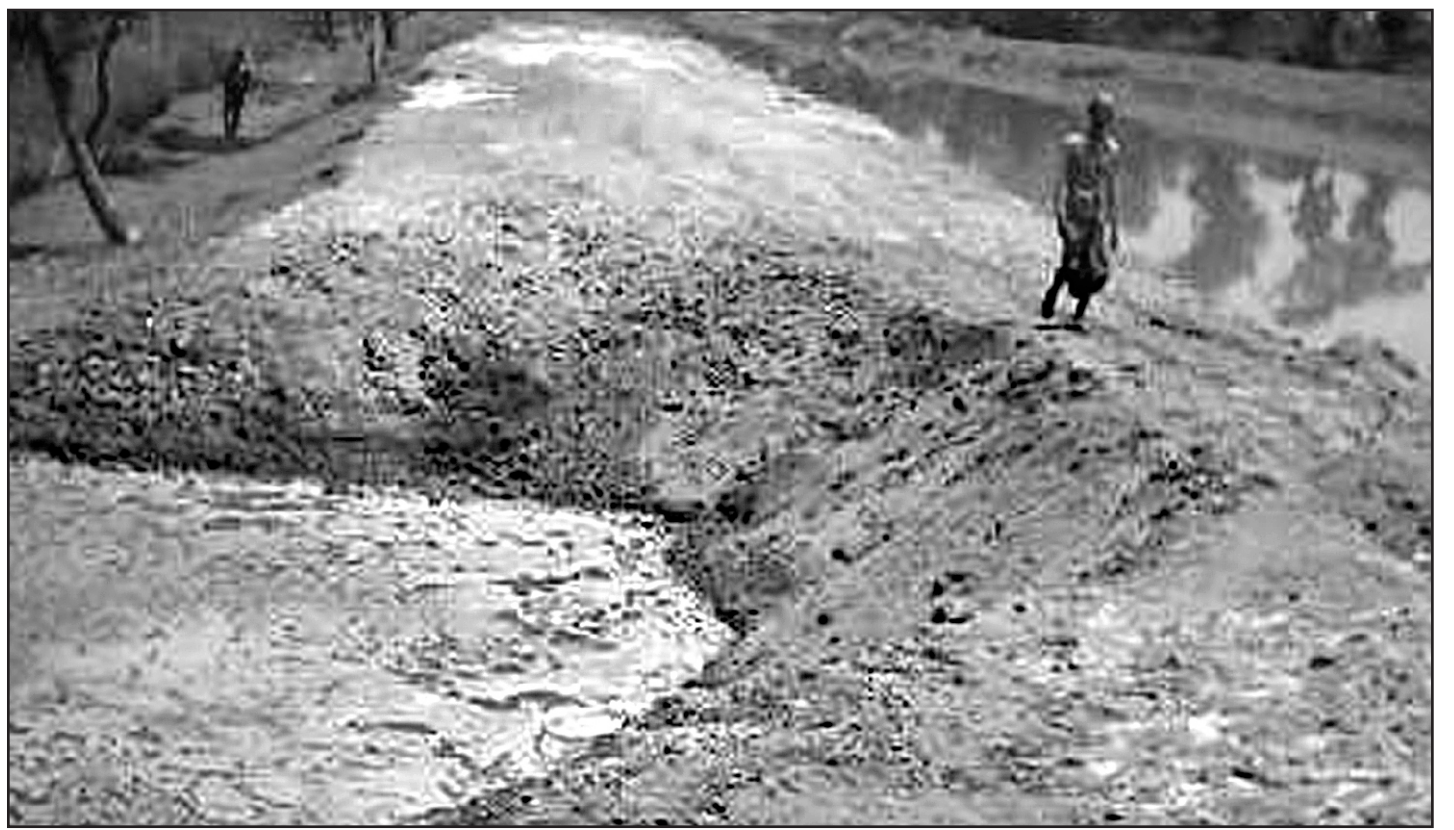
Irrigation of about 15,000 hectares of land have become uncertain as repair of the damaged portion of Dinajpur Canal embankment of Teesta Irrigation Project at Kamalpara village in Nilphamari Sadar upazila was suspended yesterday as labourers refused to work alleging payment of lower wage. Irrigation is needed for Amon cultivation because of less rainfall this year.