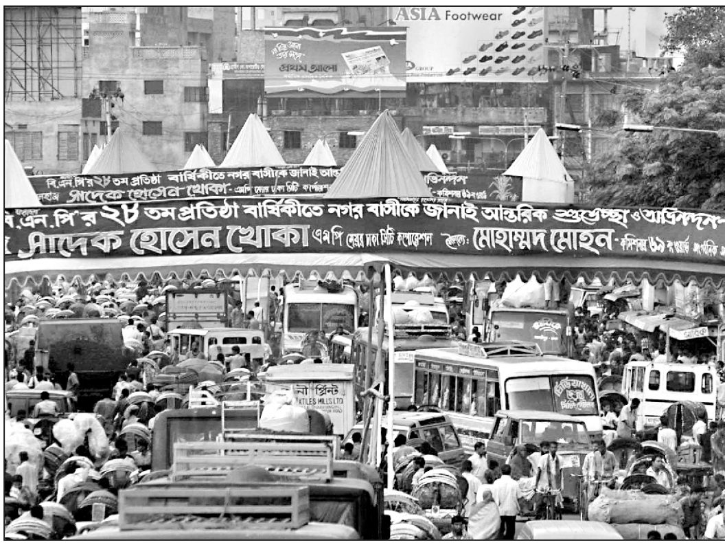
BNP has erected decorative arches in the city's Nayabazar area on the occasion of its 28th founding anniversary, causing traffic congestion. The picture was taken yesterday.

Assembly for Protection of Hijab Bangladesh will organise a seminar entitled 'Hijab in the light of human rights'. Venue: National Press Club. Time: 10:00am.