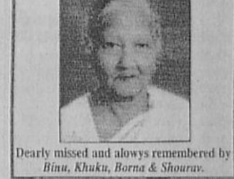
Dearly missed and always remembered by Binu, Khuku, Borna & Shourav.

INDEPENDENT HOUSE WANTED House with minimum four bed rooms / Independent House at Gulshan, Banani, Old DOHS or Cantonment Area. To be used for residential purposes only. Please Call - 8955230, 01722-121 760, 0189-207 804