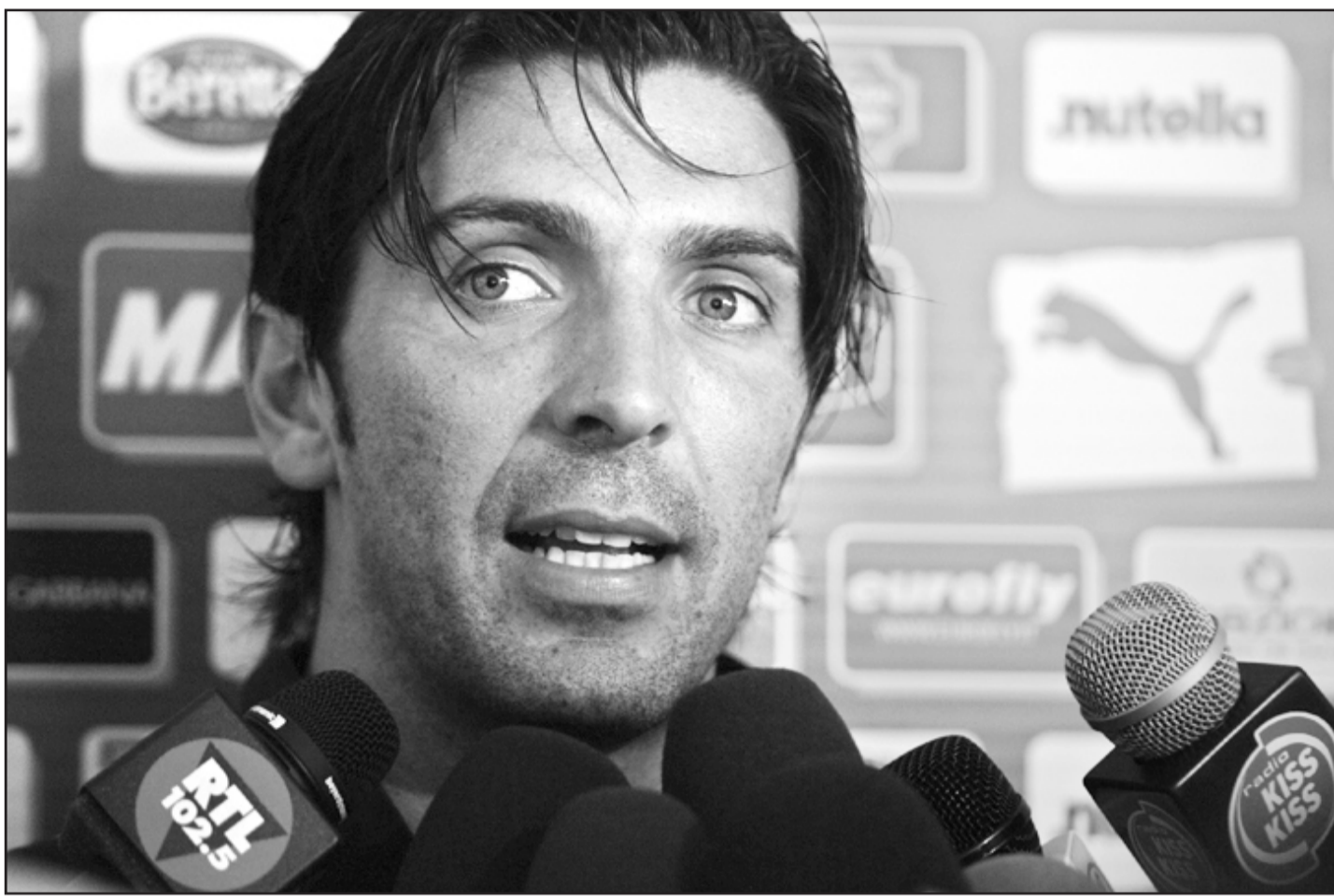
Italy goalkeeper Gianluigi Buffon answers to journalists' questions at the National Technical Centre of Coverciano in Florence on Tuesday.