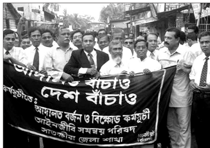
Lawyers in Satkhira boycotted courts and brought out a procession in the town yesterday as part of a countrywide programme to protest government's alleged politicisation of the judiciary.