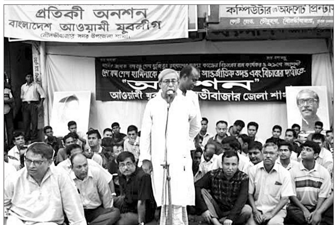
Moulvibazar Awami Jubo League staged a token hunger strike in the town yesterday demanding international probe into the August 21 grenade attack on AL chief Sheikh hasina in Dhaka in 2004 and execution of the verdict of Bangabandhu murder case.