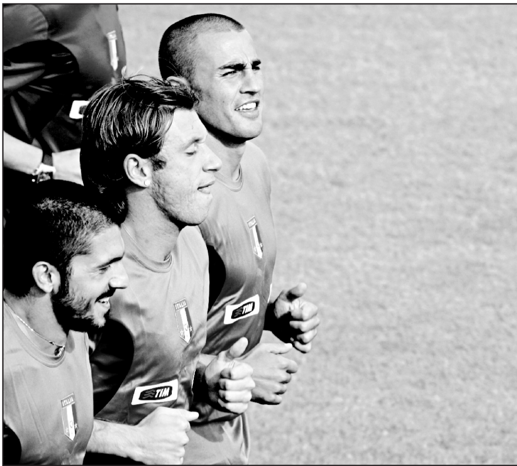
Italian trio (From L-R) Gennaro Ivan Gattuso, newly recalled Antonio Cassano and captain Fabio Cannavaro run as part of their training session at the National Technical Center of Coverciano in Florence on Monday.

And if initial impressions are something to go by than the 10,000 Valencia fans who came to welcome the Spanish star and their record signing to the club should well find Joaquin a nice home.