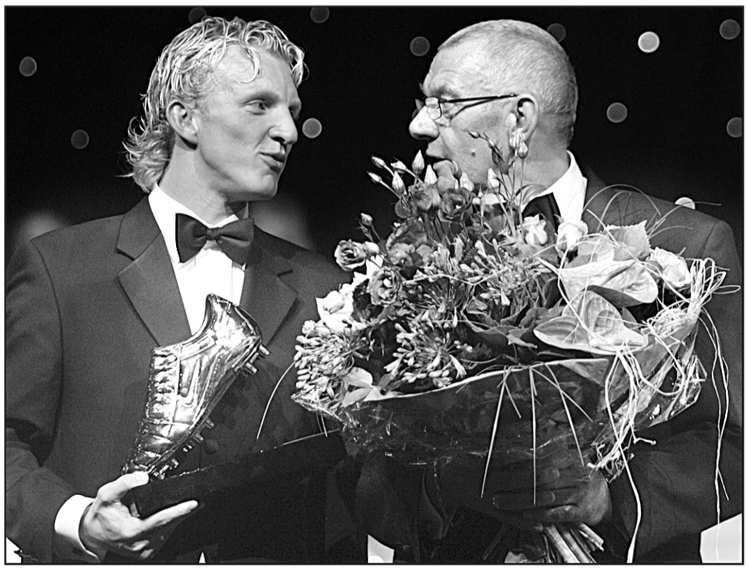
New Liverpool forward Dirk Kuyt (L) receives the award for Dutch player of the year from his father during a ceremony in Hilversum on Monday.