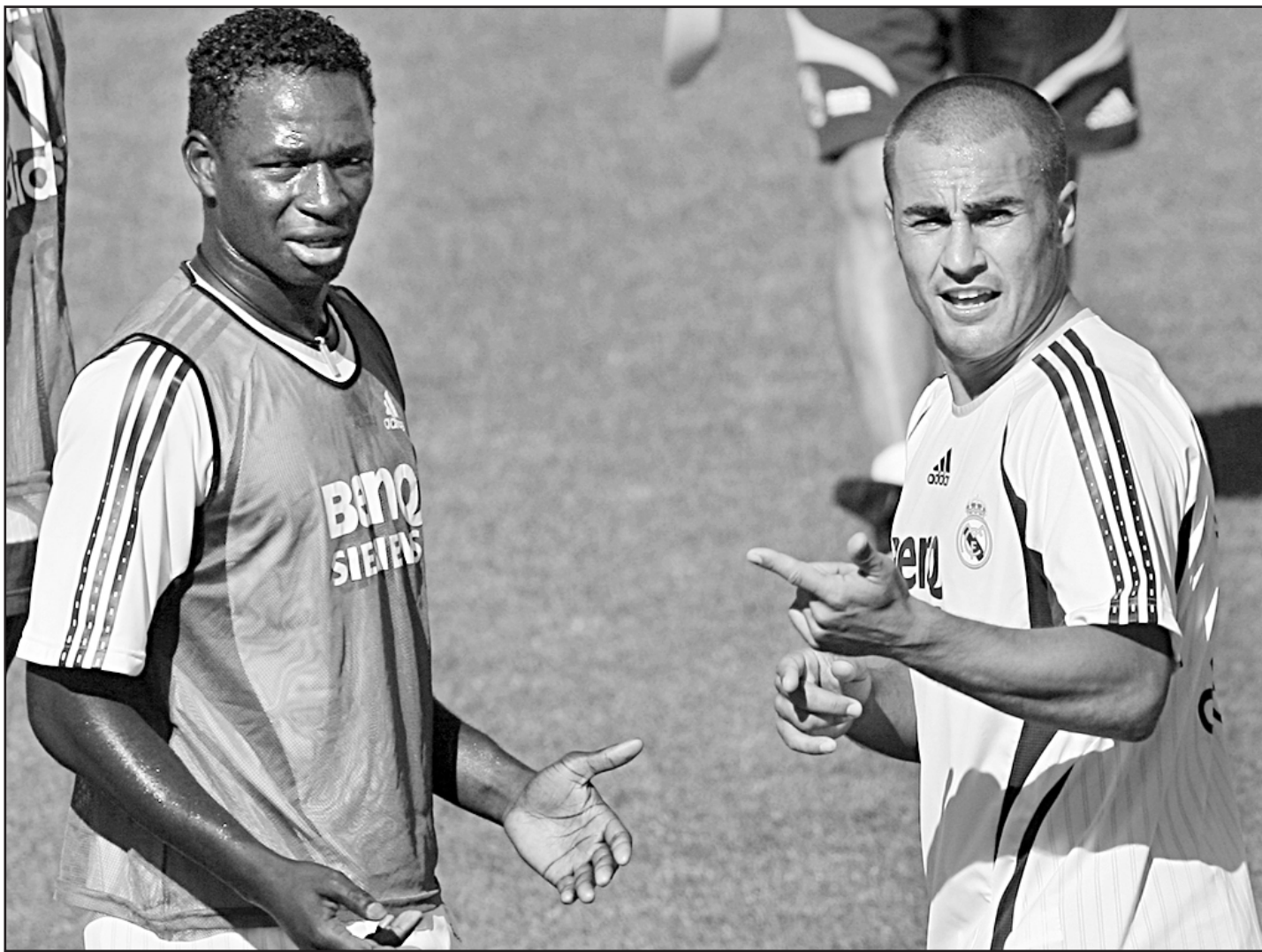
Real Madrid new recruits Mahamadou Diarra (L) and Fabio Cannavaro gesture during a training session in Madrid on Friday.