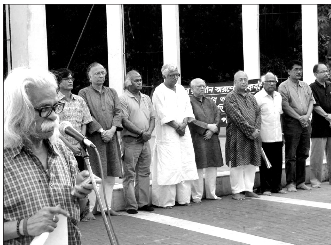
Kobita Parishad observes one minute's silence at a discussion in memory of poet Shamsur Rahman at the Central Shaheed Minar in the city yesterday.

In the afternoon, she went to Labaid Cardiac Hospital to see her ailing husband Dr Wajed Miah, a noted nuclear scientist, who has been suffering from cardiac arrest since Friday night.