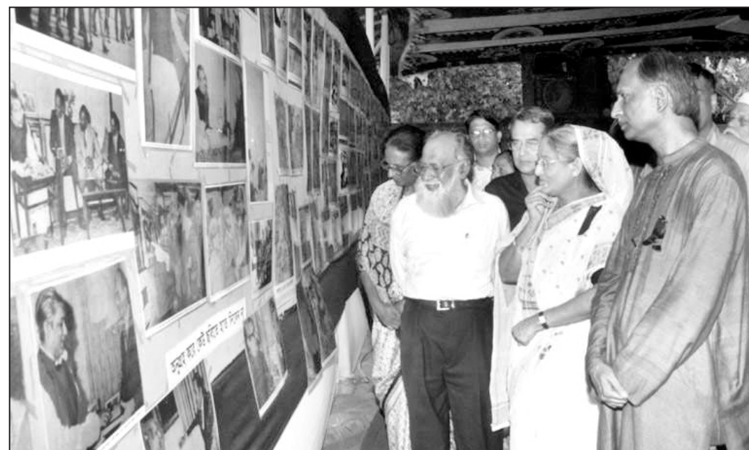
Awami League President Sheikh Hasina visits a photo exhibition in front of Bangabandhu Museum in the city yesterday. Bangabandhu Lalitakala Academy organised the exhibition.

Besides, 11-Dal, 5 leftist political parties, Jatiya Samajtantrik Dal, Bangladesh Samajtantrik Dal, Bangladesh Chhatra Moitri, Jatiya Sramik Federation Bangladesh, Bangladesh National Awami Party, Jatiya Gono-Front, Gonosanghati Andolon, Zaker Party, Samajtantrik Sramik Front, Samrajjobad Birodhi Gonotantrik Oikyo, Jatiya Gonotantrik Front, Jatiya Chhatra Dal, Bangladesh Chhatra Federation and Sammitia Samajik Andolon also condemned the killing.