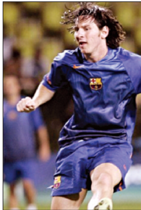
From (L-R) Fernando Torres is the biggest hope for goals for an erratic Atletico Madrid, while Ruud van Nistelrooy's inclusion to title-contenders Real Madrid will add new force to an already potent attack, as current title-holders Barcelona will be looking to their Argentine prodigy Lionel Messi to provide their strikers with enough firepower.