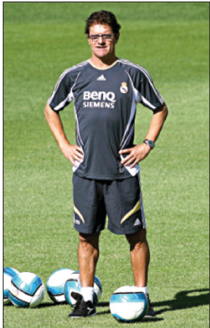
Fabio Capello could be the biggest 'player' of the Primera Liga season.

blame on to Spain's refs, and having milked the club for as many motorways as he could build, Florentino Perez finally sacked the man really responsible: himself. What that will bring for Real is something we can only wait and see.