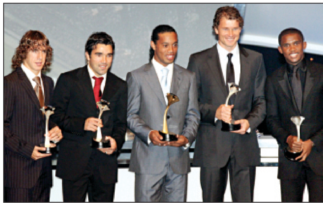
(From L) The UEFA best defender of the year Carlos Puyol, best midfielder Deco, best player Ronaldo, best goalkeeper Jens Lehmann and best forward Cameroonian Samuel Eto'o pose with their respective trophies after the draw of the group stages of the 2006-07 European Champions League in Monaco on Thursday.