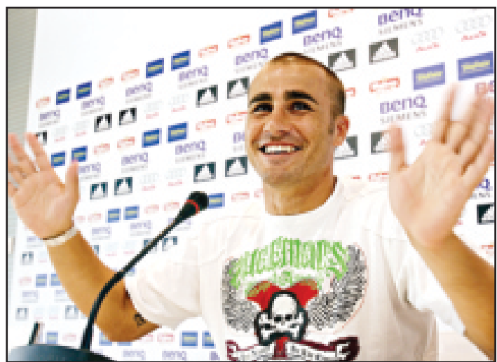
Real Madrid have strengthened their defence by signing Italy's World Cup winning captain Fabio Cannavaro.