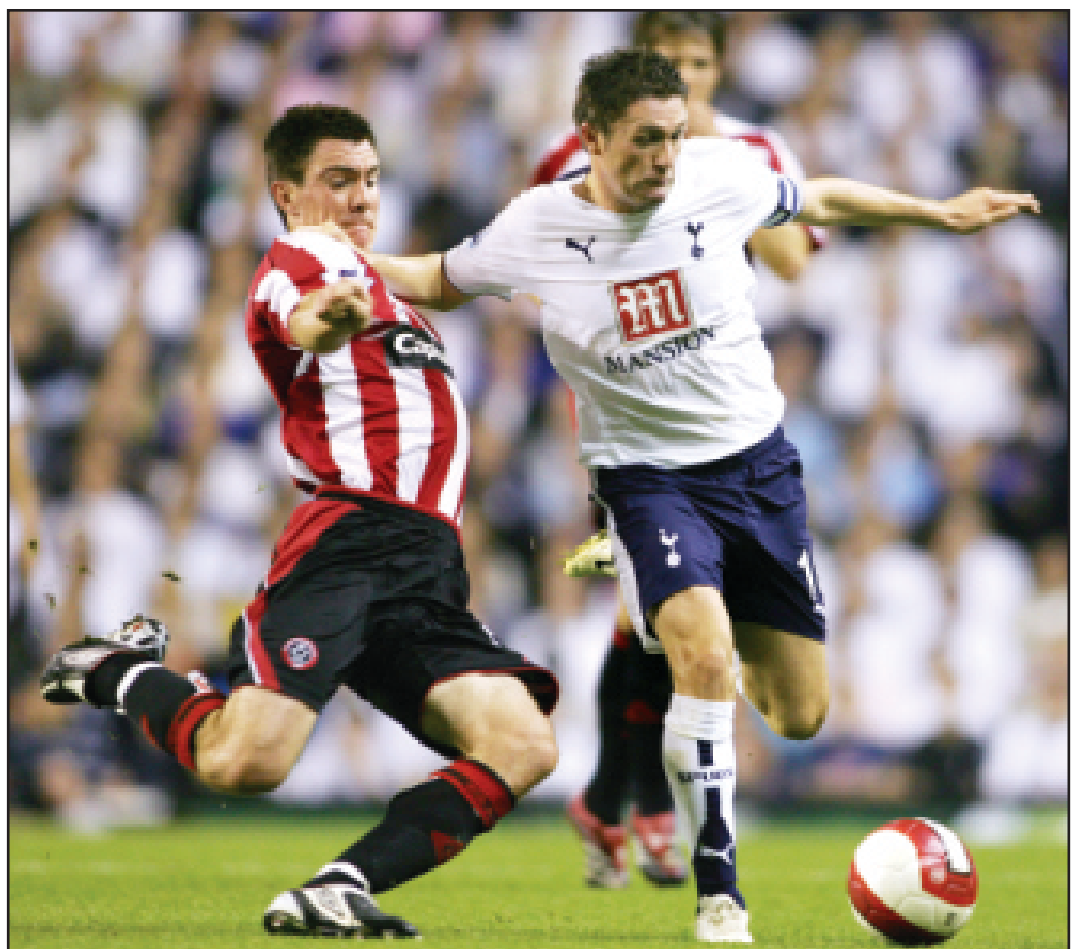
Tottenham striker Robbie Keane (R) tries to shrug off the attention of Sheffield United captain Chris Morgan during the Premiership match at White Hart Lane on Tuesday.