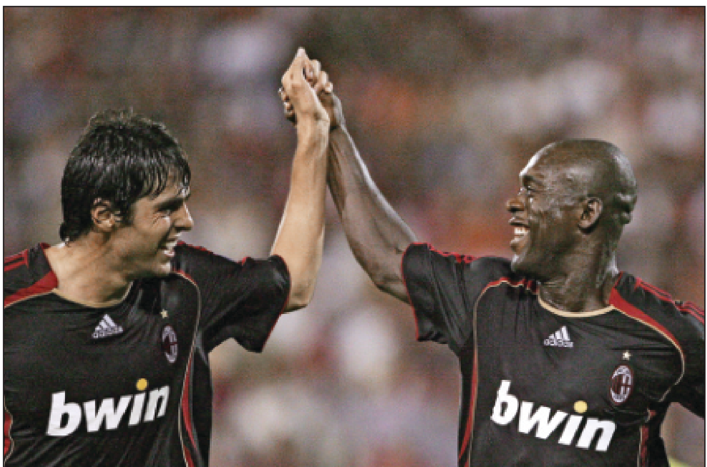
AC Milan midfield duo Kaka (L) and Clarence Seedorf celebrate the Dutchman's winning goal against Crvena Zvezda in their Champions League qualifying round clash in Belgrade on Tuesday.