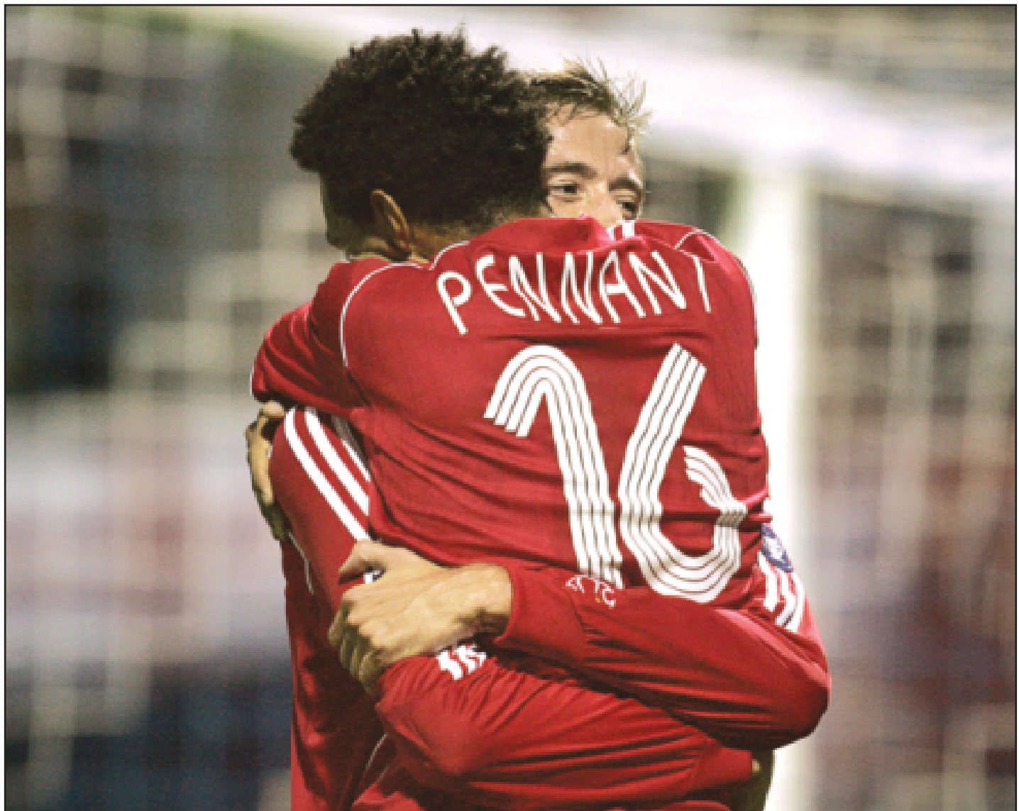
Liverpool midfielder Jermaine Pennant (R) and striker Peter Crouch celebrate after the latter scored a goal during their Champions League qualifying round clash in Kiev on Tuesday.

Those with a superstitious penchant may take a bet on AC Milan winning the trophy as the last time they landed the title in 2003 they again started in the third preliminary round with Inzaghi scoring twice like he did in this tie.