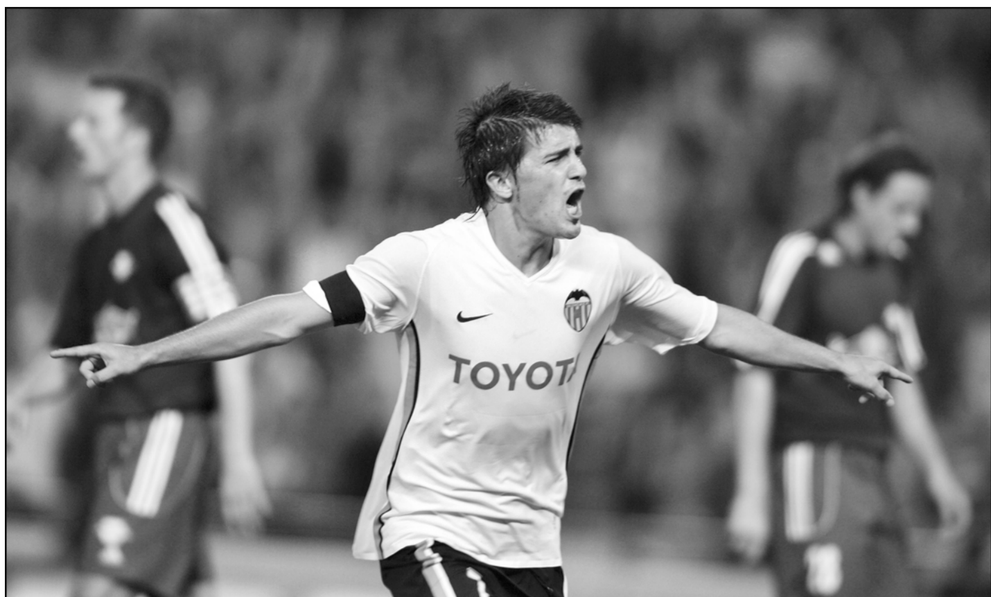
VIVA VILLA: Valencia's Spanish international forward David Villa is elated after scoring against Salzburg in Tuesday's Champions League qualifying match at the Mestalla.