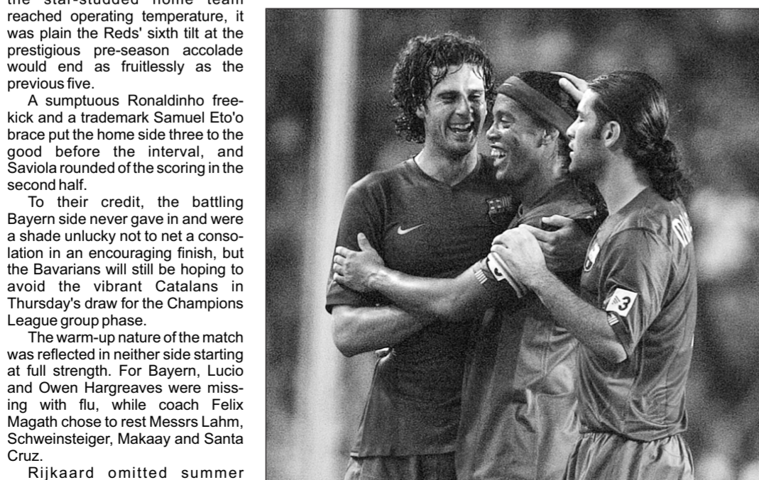
Barcelona forward Ronaldinho (R) is congratulated by teammates Thiago Motta (L) and Rafael Marquez (R) following his goal against Bayern in the Joan Gamper Trophy at the Camp Nou on Tuesday.

The Cryptquip is a substitution cipher in which one letter stands for another. If you think that X equals O, it will equal O throughout the puzzle. Single letters, short words and words using an apostrophe give you clues to locating vowels. Solution is by trial and error.