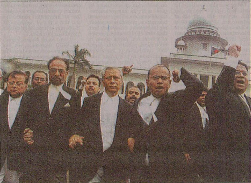
Supreme Court Bar Association leaders demonstrate on the Supreme Court premises yesterday against 'politicisation' in the appointment of High Court judges.

Jamaat secretary general told reporters, "We have discussed the Ershad issue with the PM. Now, our Majlis-e-Shura will finalise the decision on our stand over Ershad's inclusion and then we will meet the PM again to convey the decision." "The four-party alliance will remain united and Jamaat will contest the upcoming elections under the alliance," he added. Jamaat sources said the PM told the Jamaat delegation that she will look into the matter. She also requested the Jamaat leaders to consider the BNP's move to include the JP in the alliance to ensure victory in the next election. SEE PAGE 15 COL 6