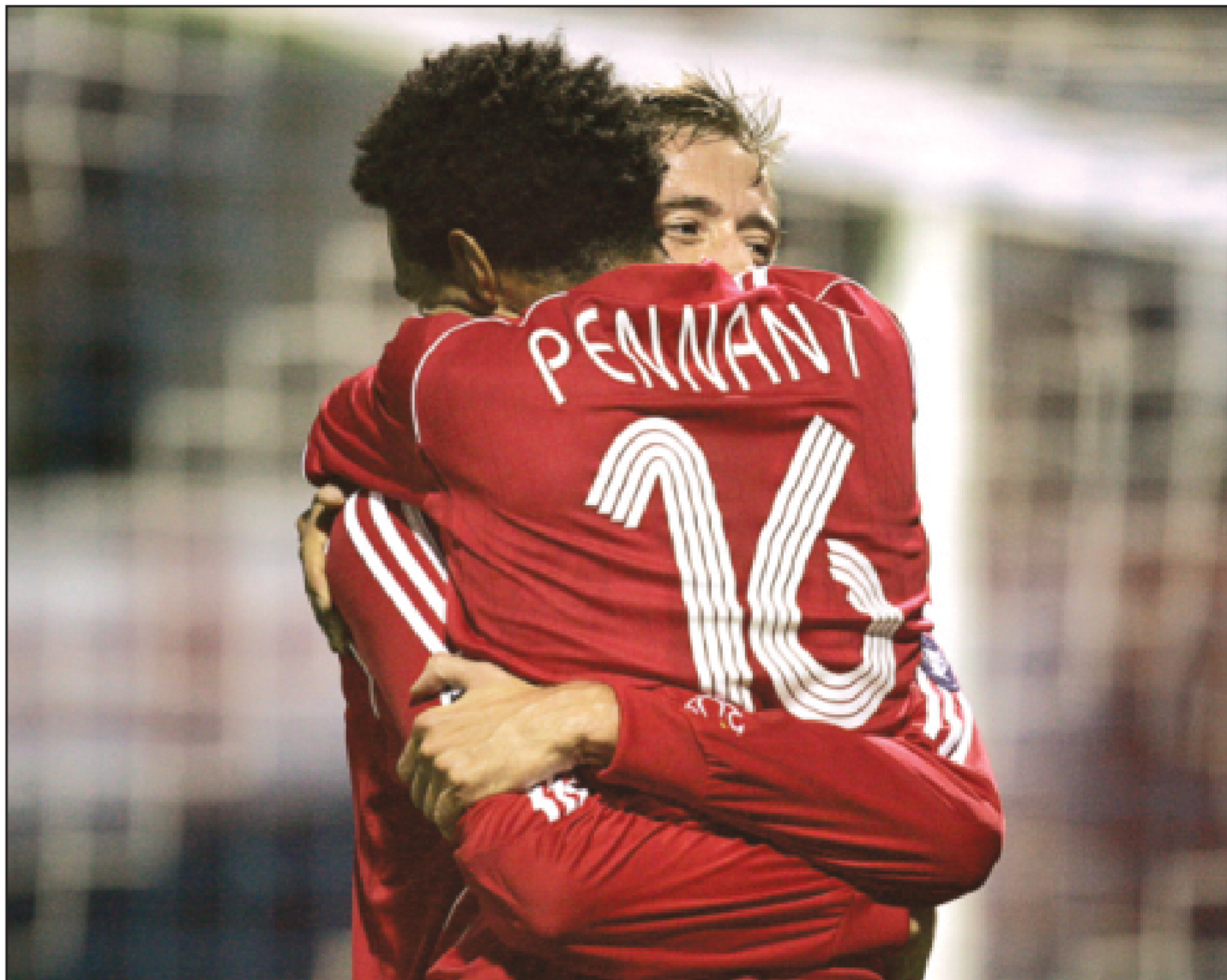
Liverpool midfielder Jermaine Pennant (R) and striker Peter Crouch celebrate after the latter scored a goal during their Champions League qualifying round clash in Kiev on Tuesday.

Those with a superstitious penchant may take a bet on AC Milan winning the trophy as the last time they landed the title in 2003 they again started in the third preliminary round with Inzaghi scoring twice like he did in this tie.