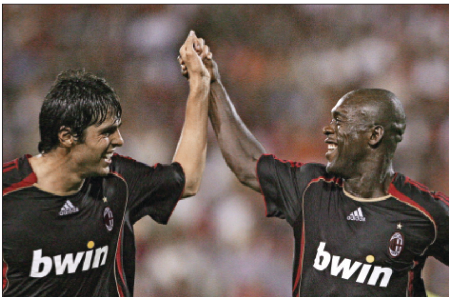
AC Milan midfield duo Kaka (L) and Clarence Seedorf celebrate the Dutchman's winning goal against Crvena Zvezda in their Champions League qualifying round clash in Belgrade on Tuesday.

Goalkeepers: Quim (Benfica), Ricardo (Sporting Lisbon) Defenders: Fernando Meira (Stuttgart/GER), Marco Caneira (Sporting Lisbon), Nuno Valente (Everton/ENG), Paulo Ferreira (Chelsea/ENG), Ricardo Carvalho (Chelsea/GER), Ricardo Costa (FC Porto), Ricardo Rocha (Benfica) Midfielders: Deco (FC Barcelona/ESP), Petit (Benfica), Carlos Martins (Sporting Lisbon), Joao Moutinho (Sporting Lisbon), Costinha (Atletico Madrid/ESP), Tiago (Lyon/FRA) Strikers: Cristiano Ronaldo (Manchester United/ENG), Ricardo Quaresma (FC Porto), Helder Postiga (FC Porto), Hugo Almeida (Werder Bremen/GER), Luis Boa Morte (Fulham/ENG), Simao Sabrosa (Benfica), Nuno Gomes (Benfica).