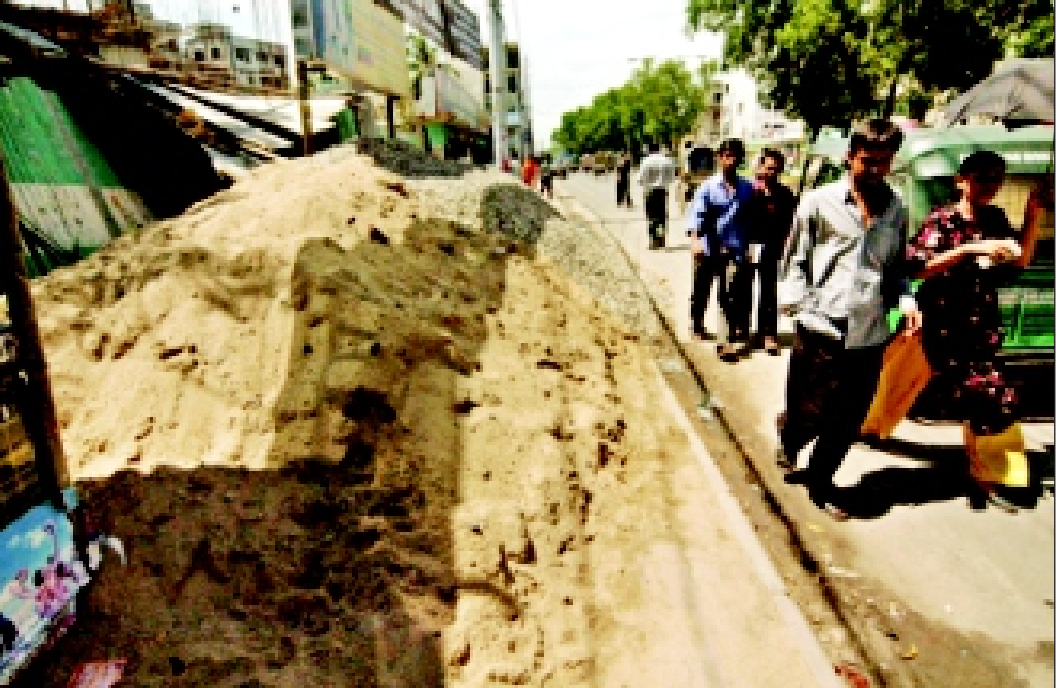
Construction materials are kept on a pavement on Rokeya Sarani at Sheorapara in the capital putting pedestrians in harms way by forcing them to walk on the road.

looked and saw the other train coming from behind, screeching, said Khalil Sheikh Khalil, who had SEE PAGE 15 COL 6