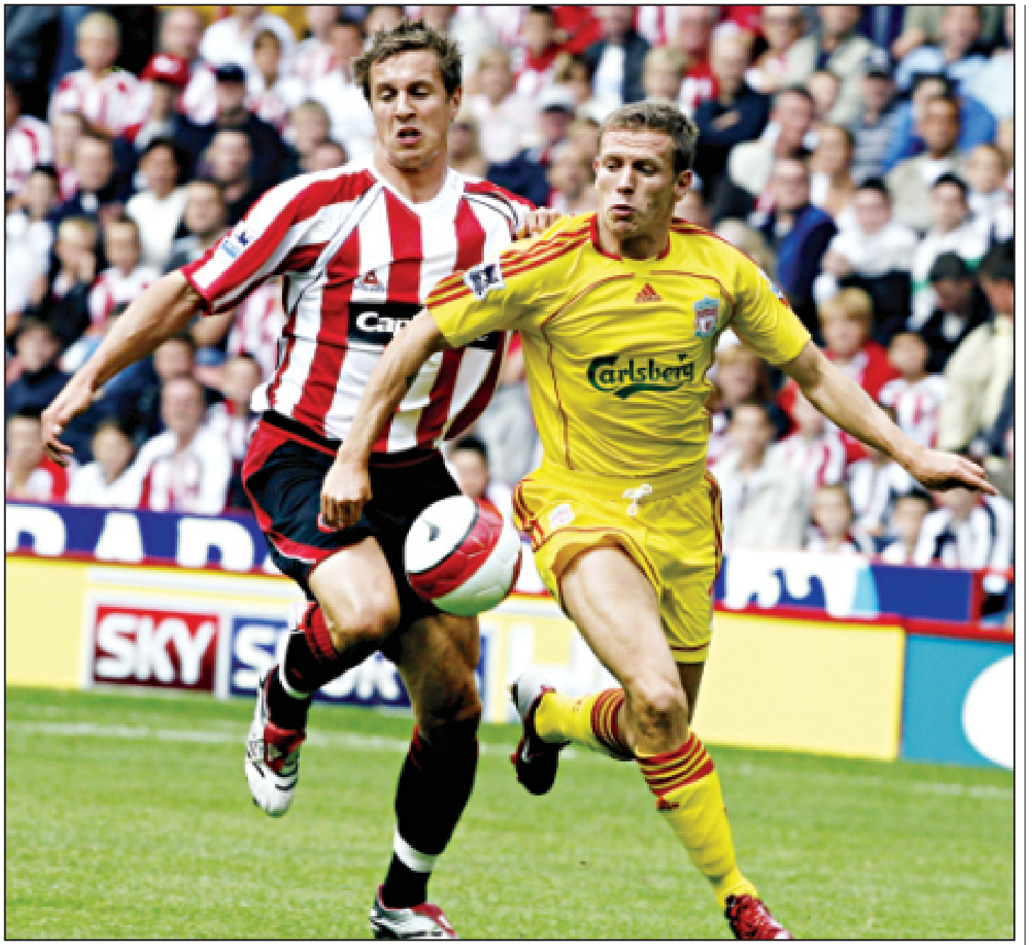
Liverpool's new recruit Craig Bellamy (R) tries to shrug off a challenge from Sheffield United's Phil Jagielka during the opening match of the Premiership season at Bramall Lane in Sheffield on Saturday.