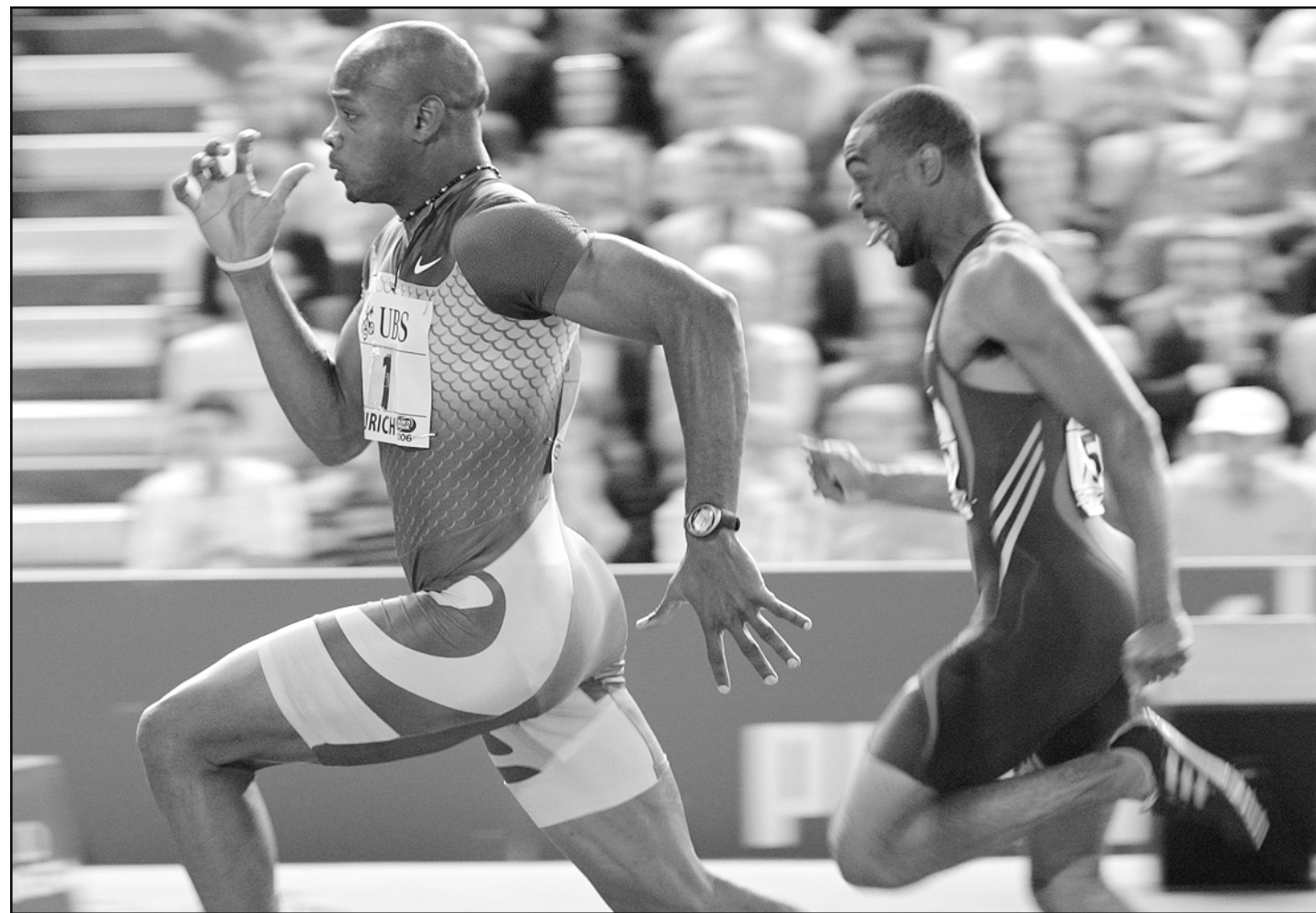
Jamaican star sprinter Asafa Powell (L) goes ahead of American Tyson Gay to win the 100 meters race at the IAAF Golden League in Zurich on Friday.

The Cryptoquip is a substitution cipher in which one letter stands for another. If you think that X equals O, it will equal O throughout the puzzle. Single letters, short words and words using an apostrophe give you clues to locating vowels. Solution is by trial and error.