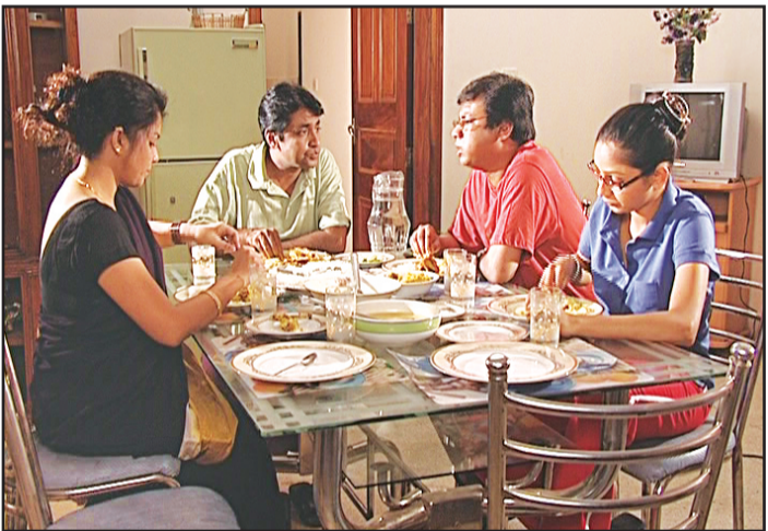
The cast of Bhrammoman Golpokar