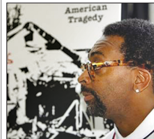
Spike Lee with the poster of his film

Filmmaker Spike Lee's new documentary about the Hurricane Katrina disaster in New Orleans will have its Canadian opening at the Toronto International Film Festival (TIFF).