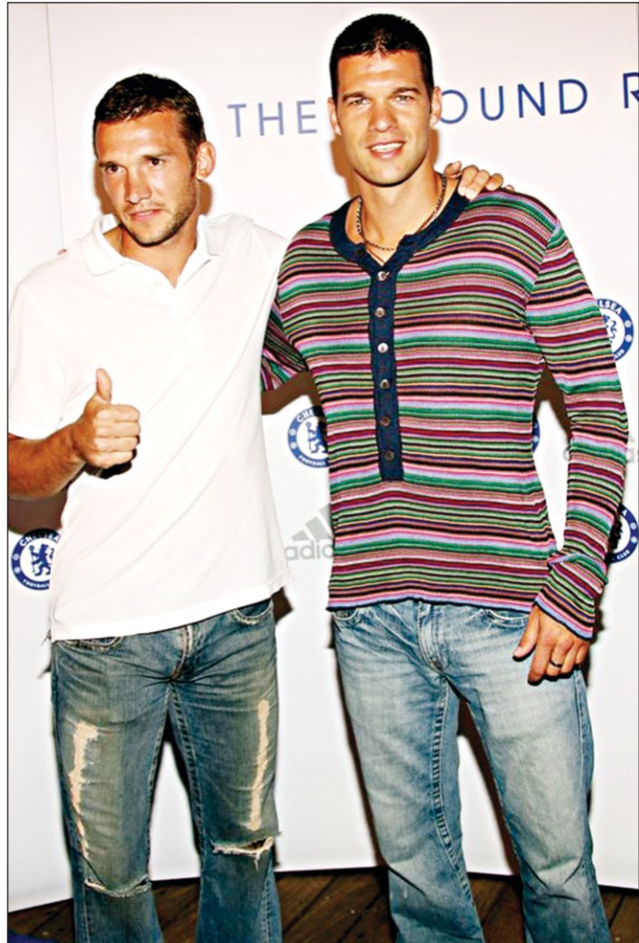
Chelsea's new recruits, Andriy Shevchenko (L) and Michael Ballack will add distinctive class to the Premiership.

Ballack is even more of a conundrum. Half the world reckons that he is a world-beater, the other half quick to consign him as just another average German. Jose Mourinho possibly belongs to the first group because he made the ex-Bayern