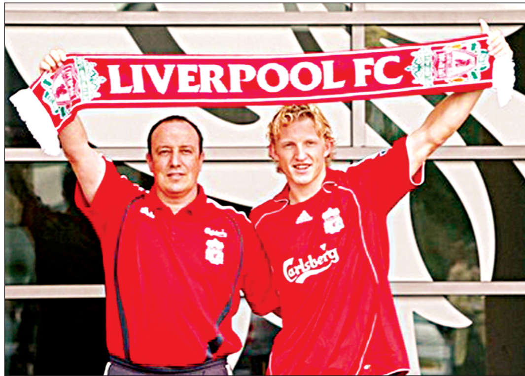
Liverpool coach Rafael Benitez (L) and new signing, Dutch striker Dirk Kuyt, pose with a team scarf at the Melwood training ground in Liverpool on Friday.

"We've signed players who haven't been really expensive but who are of good quality and who we know will do a good job for us."