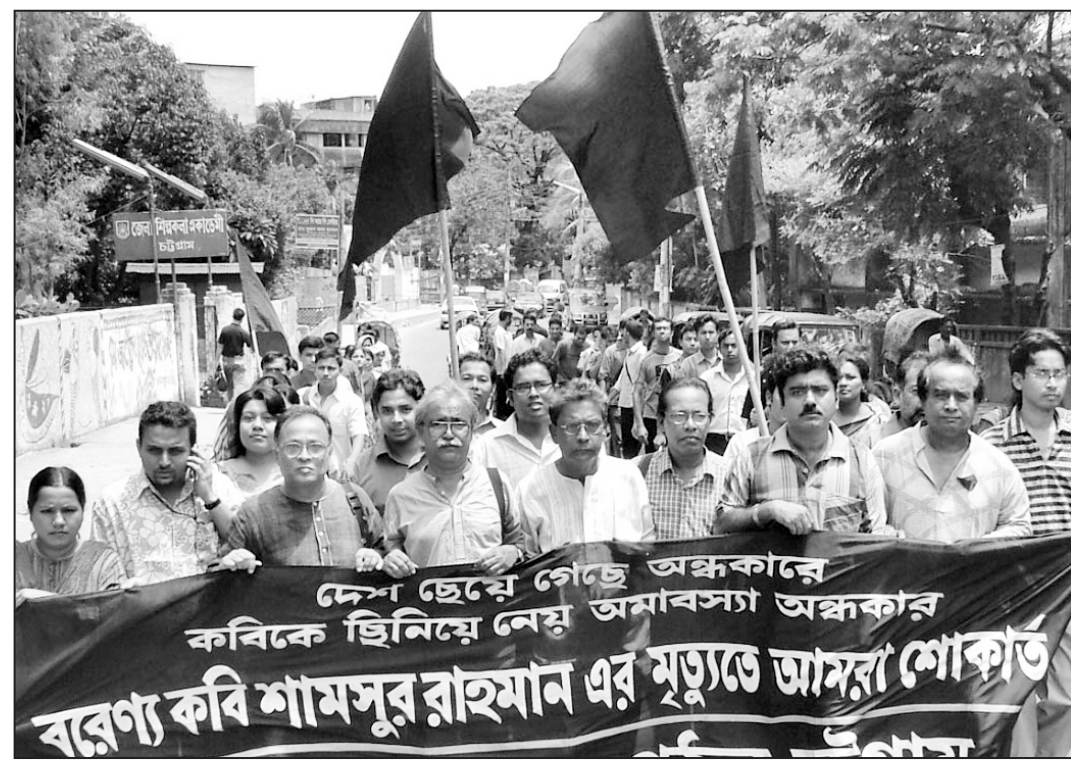
Proma Abritty Sangathan takes out a mourning procession in Chittagong yesterday condoling the death of poet Shamsur Rahman.

On the occasion, a milad and doa mahfil will be held at his home at Kazi Kandi village in Narsingdi after Zohr prayers.