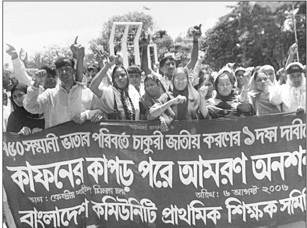
Community primary teachers stage a demonstration at the Central Shaheed Minar in the city yesterday demanding nationalisation of their jobs.

Recently, she has been living in Kolkata, a city she describes as closest to her home.