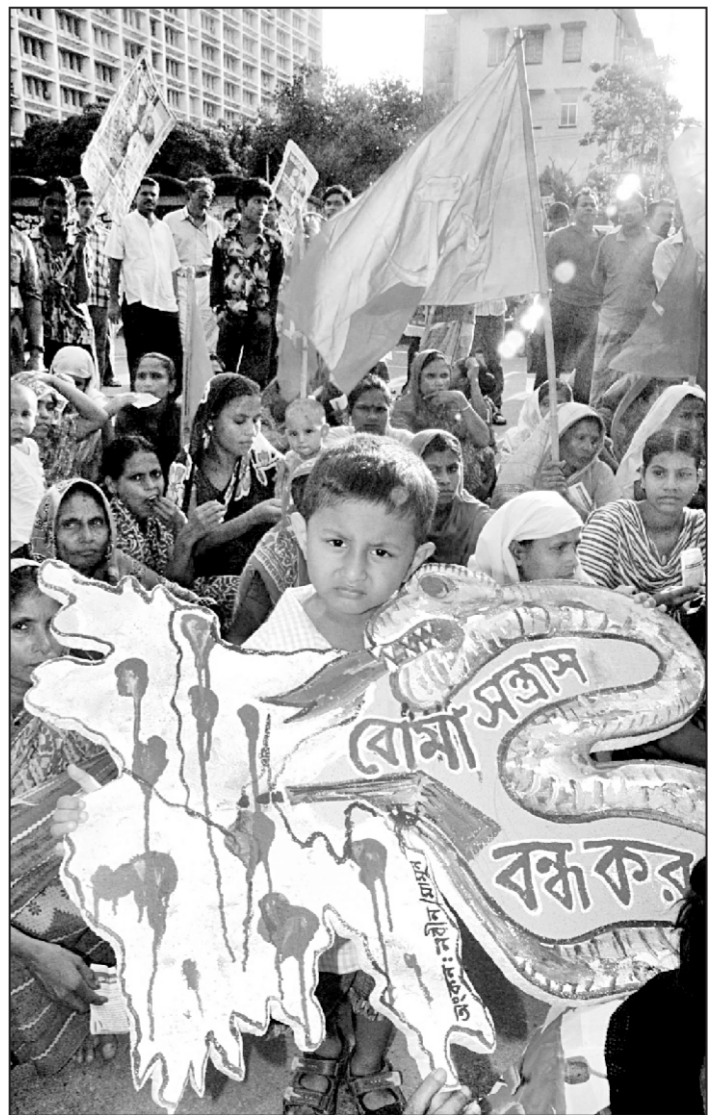
Workers' Party of Bangladesh stages a demonstration at Muktangan in the city yesterday demanding fresh investigation into the attack on Rashed Khan Menon. Miscreants launched an attack on Menon on August 17, 1992.