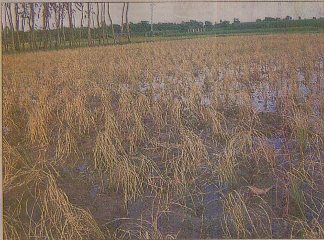
An Aman field in Mahasthangarh area of Bogra turned dry due to prolonged drought.