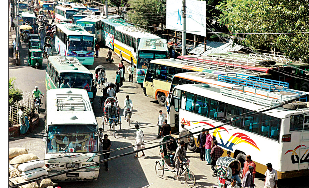
The inter-city buses are parked haphazardly at key points of the city roads causing serious gridlock everyday due to lack of terminals. The picture was taken from Station Road.